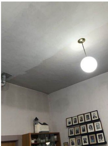
Painting of the lounge area at Zion is well underway!