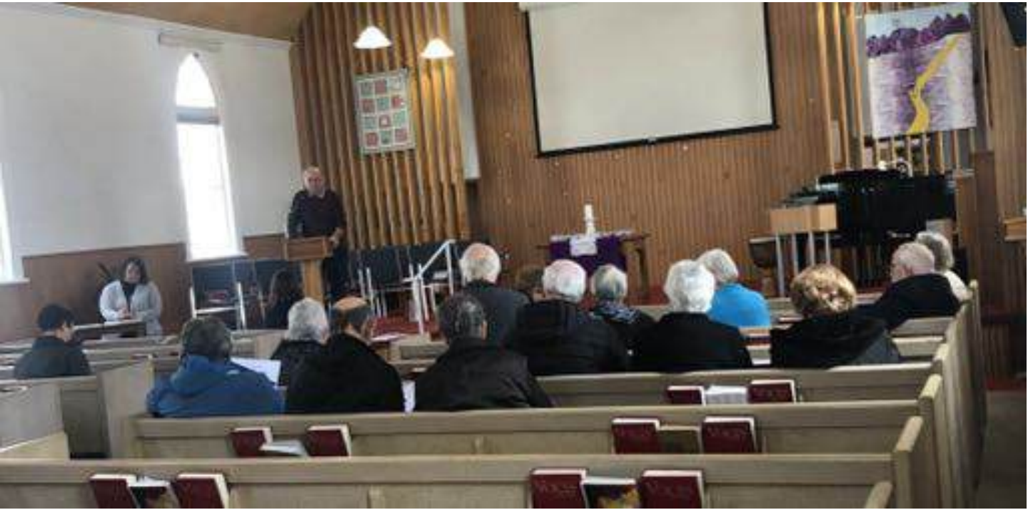
AGM Meeting at Zion