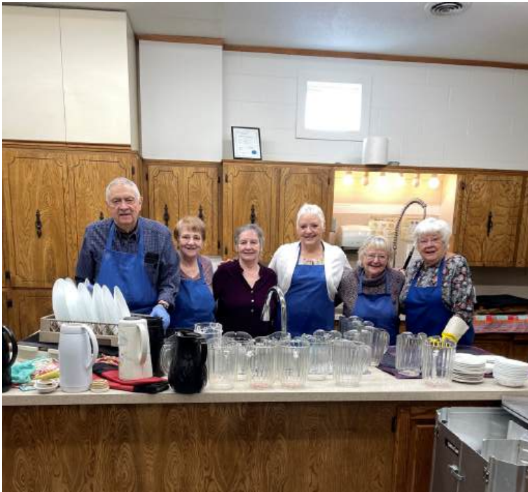
Dish duty at the Seniors Hall, Enderby, February 21st, 2024