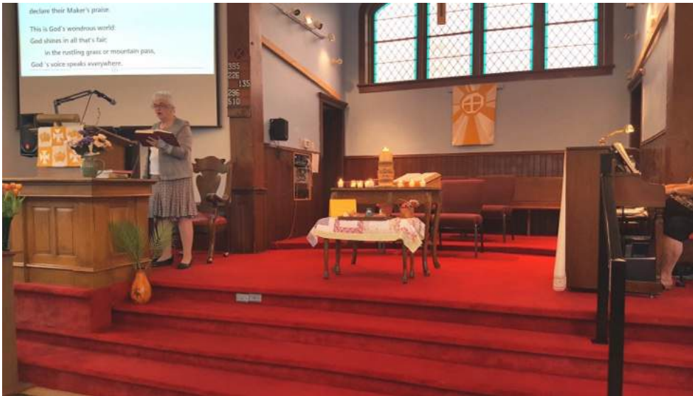
Left: A picture of St. Andrew's United with our "Cherish the Earth" display on Earth Sunday this past week.