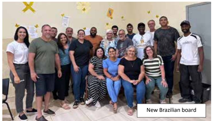
New Brazilian board

Praise God our after school program, CTE Adonai, is serving an average of sixty children regularly. In addition to devotional times and workshop activities, we also provide transportation, showers, breakfast, lunch, and afternoon snacks. Please continue to keep this ministry in your prayers.