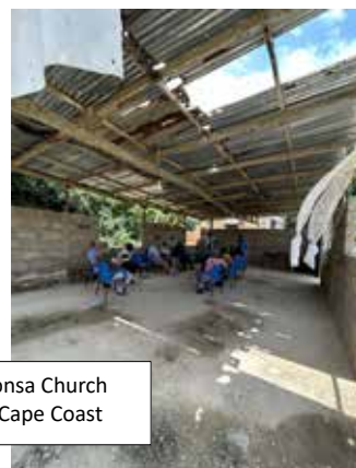
Yamaronsa Church Plant- Cape Coast