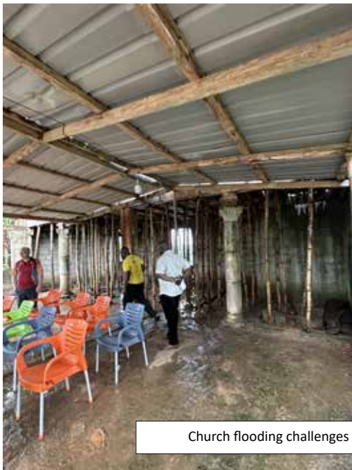
Church flooding challenges

Each stop represented a similar set of opportunities and challenges. We met with local pastors whose congregations ranged from about 25-75 members, and they shared with us their hearts for reaching people in their respective communities. The challenges were presented by their makeshift places of worship. Some new churches had mud floors (it was