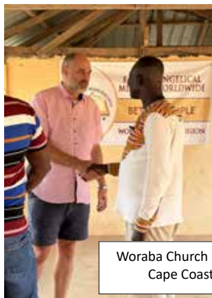
Woraba Church Plant- Cape Coast

Retired Pastor's Residence: One final need continues to be the construction of a residence for retired pastors. Construction is underway, but more funding will be needed to complete the project. Many pastors, once it is time for them to step down from their ministries, have no place to go. Their families are often poor and lack adequate housing to take them in, and as many of us know, clergy and missionaries rarely have enough income to put money away for retirement. The building under construction intends to alleviate some of these issues.