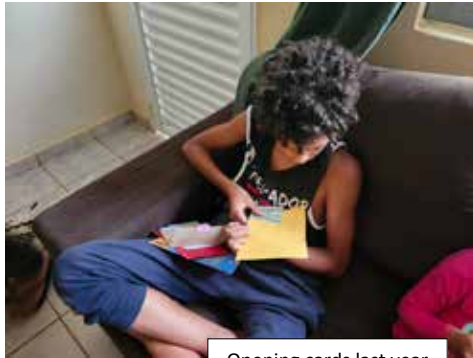
Opening cards last year

Dear Friends, Greetings from Brazil! It's that time of year again when we like to encourage you to send Christmas cards to our boys. They so look forward to this annual tradition and it is a special gift just for them. Due to post office issues here, it is difficult to receive packages and manila envelopes, so we would ask that individual cards be mailed instead. If you would like, you can include small items in your cards such as stickers, dollar bills, sticks of gum, etc. We are so grateful for all of you who have taken the time, money, and effort to put together cards for the boys in years past!