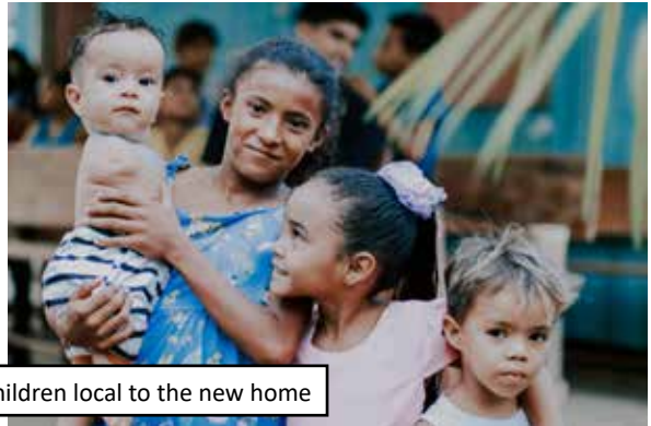
Children local to the new home

God has been doing wonderful things here these last months and we are thankful for the generous part you have been in all He is doing.