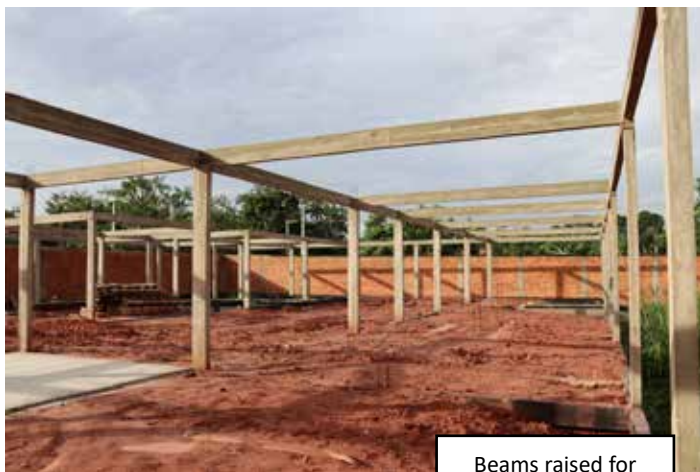
Beams raised for Childrens' Home

students, dentists, dental students, physical therapists, nutritionists, and church workers and young people who