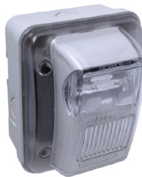
AUDIO / VISUAL WARNING BEACON