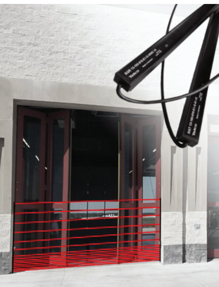
EXTERIOR LIGHT CURTAIN PHOTO EYES