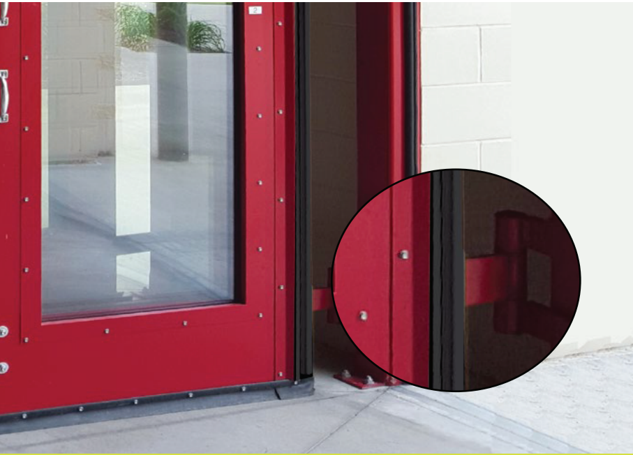
MONITORED ELECTRIC SAFETY EDGES

INNOVATIVE SAFETY FEATURES TO KEEP YOUR FOUR-FOLD DOOR SYSTEM OPERATING SAFELY & EFFICIENTLY