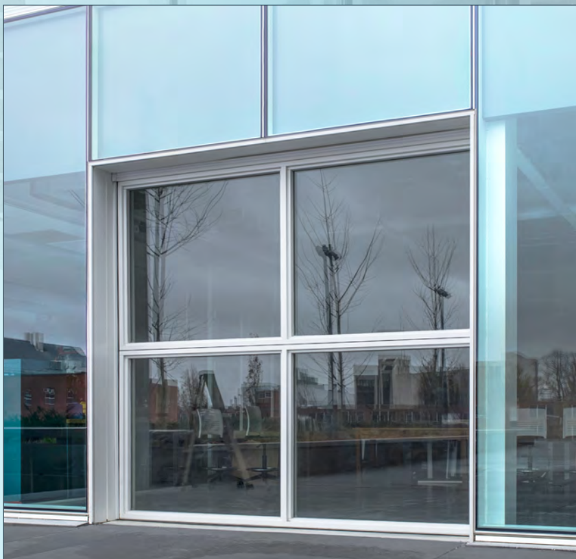
Cover Image: Arc3D™ Duo, installed, door in partially open position