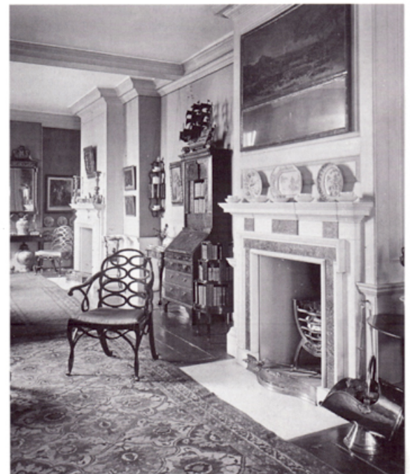
Fig. 2. Drawing room in the house of Edward Burgess Hudson (1854–1936) at 15 Queen Anne’s Gate, London, in a photograph of the 1920s.

Fig. 1. Palm Beach dining room with chairs in the Palm Beach line created by Mimi McMakin for Laneventure, 2007, from Celerie Kemble, To Your Taste: Creating Modern Rooms with a Traditional Twist (Clarkson Potter, New York, 2008), p. 126.