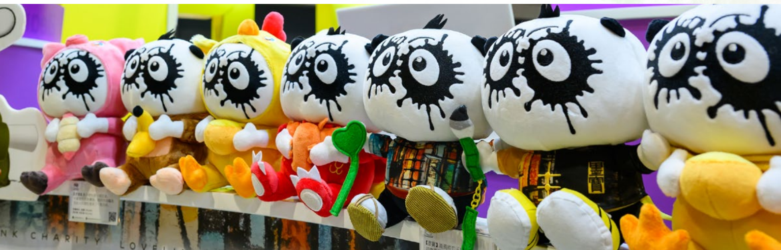
【墨寶】 - 《傳承愛慈善基金》的愛心大使 ▲

This year has been a remarkable chapter in the journey of Lovelink Charity – a year of growth, milestones, and meaningful impact, all made possible by the unwavering support of our advisors, volunteers, governance team, and everyone who has walked this path with us.