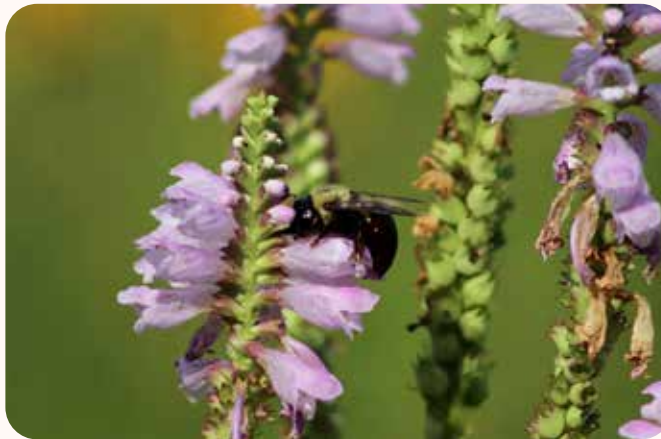
Eastern Carpenter Bee

pennsylvanicus ), the eastern carpenter bee ( xylocopa virginica ), the green sweat bee ( augochloropsis metallica ), and the mason bee ( osmia georgica ). Butterfly species include the iconic monarch butterfly ( danaus plexippus ), the tiger swallowtail ( papilio glaucus ), and the cabbage butterfly ( pieris rapae ).