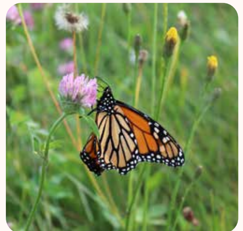
Monarch Butterfly

The monarch butterfly is one of the most easily identifiable pollinators, with its striking orange and black wings. The brilliant color of a monarch is a warning to those that might try to