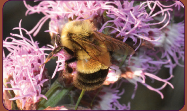
Rusty-patched bumblebee.