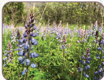
Wild Lupine ( Lupinus perennis )