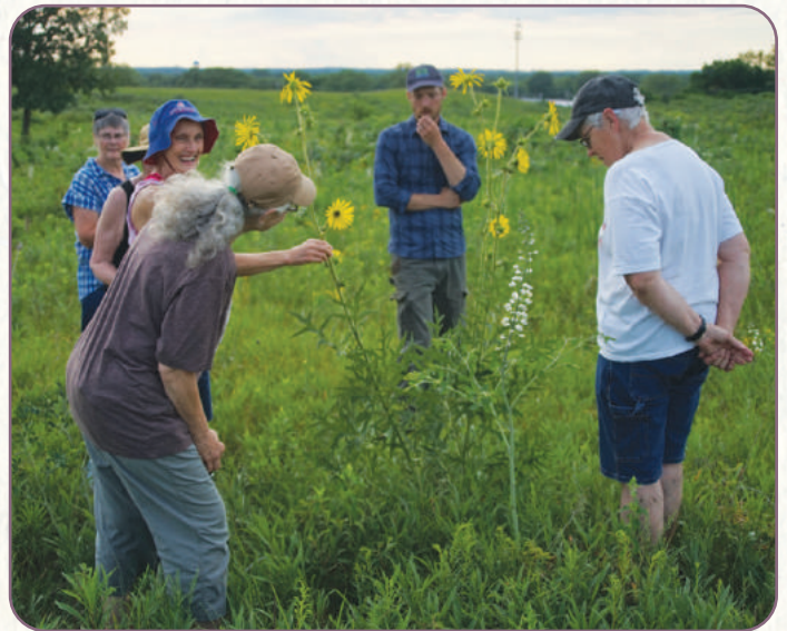
Wildflower Walkabout hikers examining a Compass plant ( Silphium laciniatum )