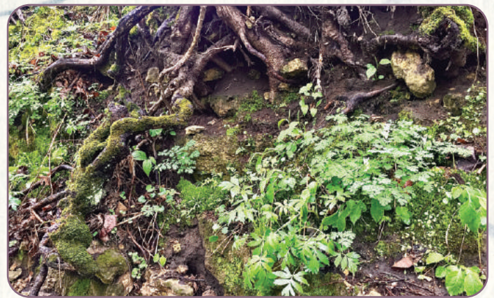
Virginia waterleaf ( Hydrophyllum virginianum ) and Dutchman's breeches ( Dicentra cucullaria ) growing on a dolomite cliff at Burr Oak Valley