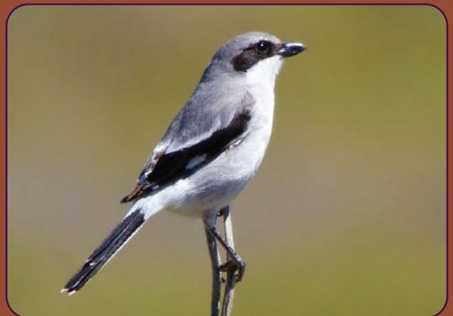
Loggerhead Shrike ( Lanius ludovicianus).