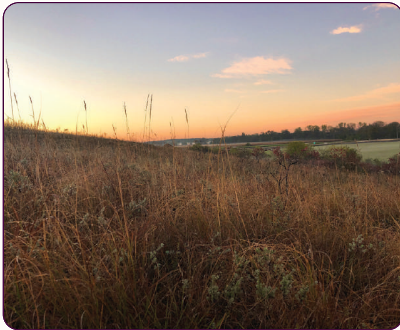
Bell Bowl Prairie in late September, 2021.

Whether plant or animal, these prairie species are so specialized that they often cannot survive outside of gravel prairies, meaning they cannot be moved into new habitats. Therefore, it is important to protect what little gravel prairie we have left and to keep it intact. When larger habitats are broken up and separated by development, such as roads or buildings, we end up with habitat fragmentation, which limits species' ability