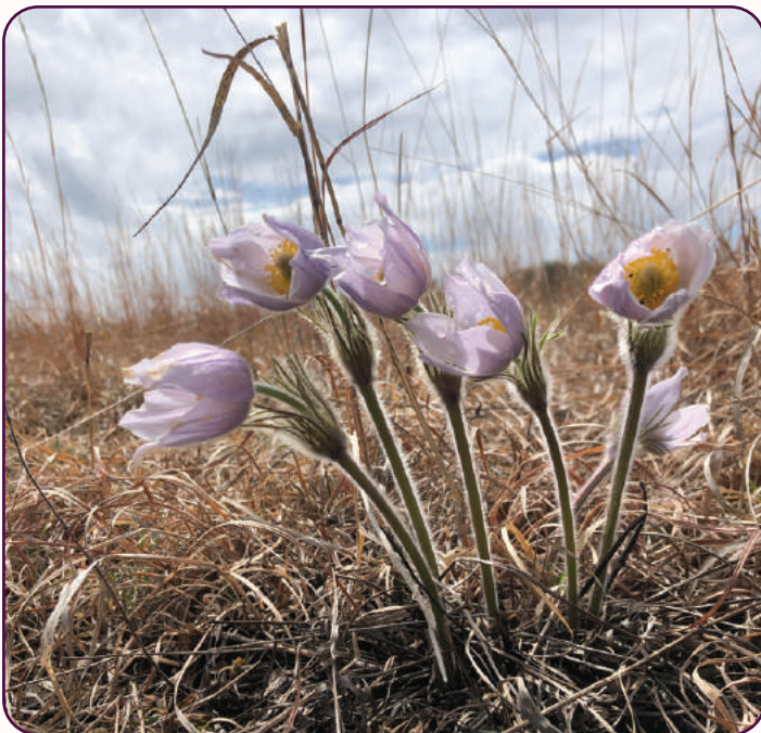
Pasqueflower ( Anemone patens ) at Stone Bridge Forest Preserve.

Some people view gravel prairies as prime real estate for urban development. The thick, gravel soils are a great base for supporting structures, but gravel prairies are much more than that. I have often heard the phrase that beauty is in the details, and I believe that gravel prairies are a perfect example of that. Even when the iconic compass plants and pale purple cone flowers aren't in bloom, there is beauty in the safety they provide to animals. There is beauty in the nutrients they give to the rare plants that call these habitats home. I cannot wait for the weather to warm and the flowers to bloom so I can see the subtle beauty of gravel prairies firsthand.