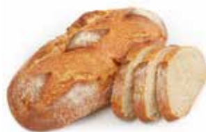
19587 Sourdough Bloomer