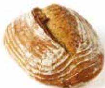
19B57 White Sourdough Bloomer