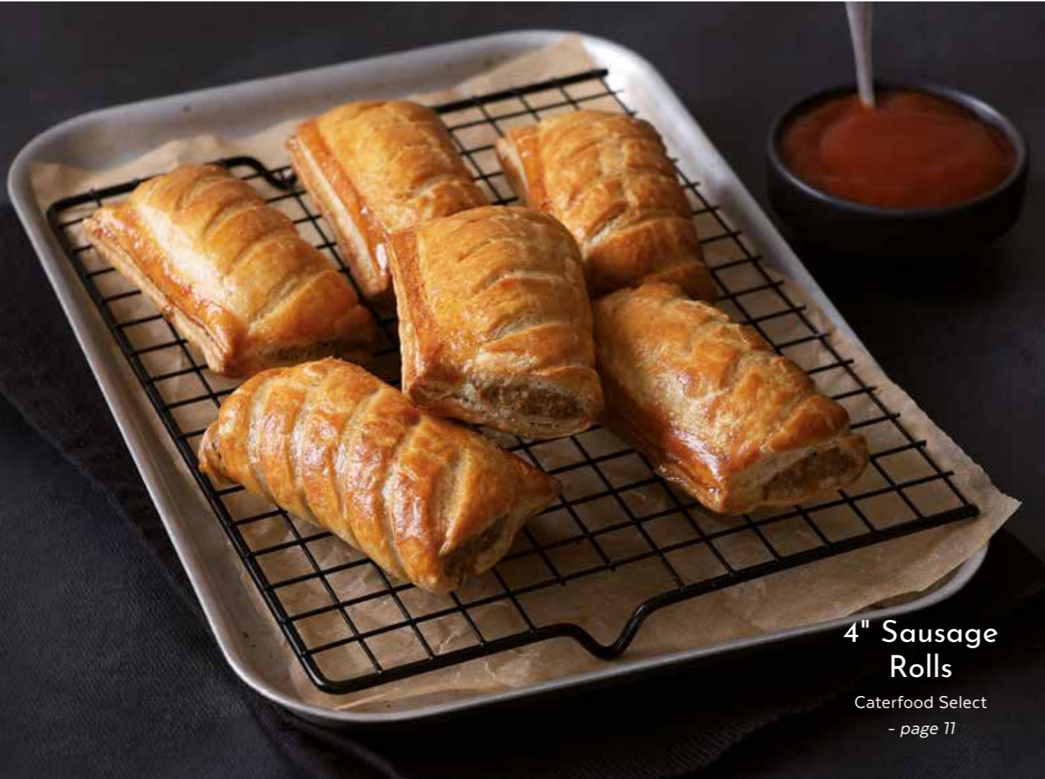
4" Sausage Rolls Caterfood Select - page 11