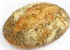
19B60 Seeded Sourdough Bloomer