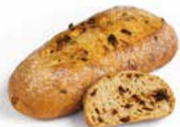
19A39 Tomato and Oregano Bloomer