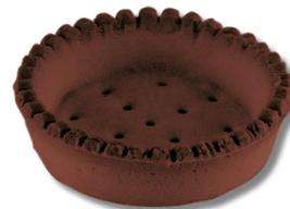
108027 Large Round Cocoa Classic Tart Bulk 2.91" (NO UPS) Atelier 1/100 ct