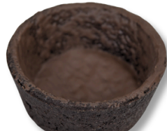
108350 Mid-Size Round Jet Black Steep Edge Tart 1.97" Atelier 1/144 ct