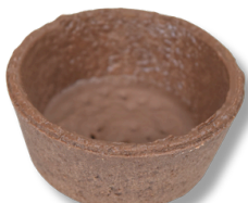
108250 Mid-Size Round Chocolate Steep Edge Tart 1.97" Atelier 1/144 ct