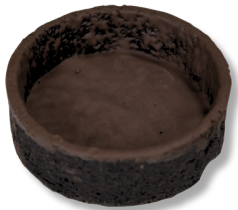
108365 Medium Round Jet Black Tart 2.55" Atelier 1/90 ct