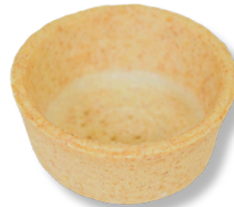
108450 Mid-Size Round Graham Steep Edge Tart 1.97" Atelier 1/144 ct