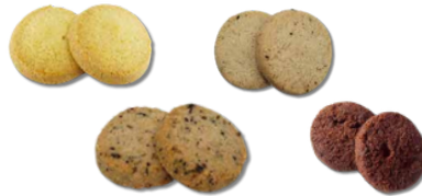
103002 Saint-Malo Sable Collection, Sweet (Classic, Rasp, Blueberry, Choc) 1.25"