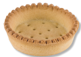
108017 Large Round Sweet Classic Tart Bulk 2.91" (NO UPS) Atelier 1/100 ct