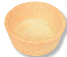
108750 Mid-Size Round Savory Steep Edge Tart 1.97" Atelier 1/144 ct