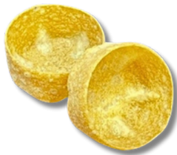
112900 Mini Croustade Shell 1.37"