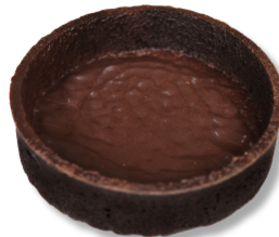
108380 Large Round Jet Black Tart 3.14" Atelier 1/72 ct