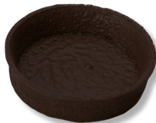
108310 Extra Large Round Jet Black Steep Edge Tart 3.93" Atelier 1/72 ct