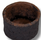
108334 Mini Round Jet Black Tart 1.33" Atelier 1/336 ct