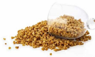
108051 Crumble Sweet All Butter Cocoa Butter Coated Atelier 1/2.2 lb