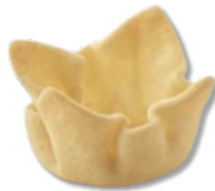
110015 Star Tartlet Neutral 1.25"