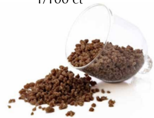
108052 Crumble Cocoa All Butter Cocoa Butter Coated Atelier 1/2.2 lb