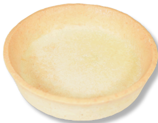
108710 Extra Large Round Savory Steep Edge Tart 3.93" Atelier 1/72 ct