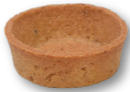
108840 Mini Round Tart Vegan 1.57" Atelier 1/216 ct