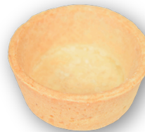
108150 Mid-Size Round Sweet Steep Edge Tart 1.97" Atelier 1/144 ct