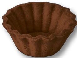
108025 Medium Round Cocoa Classic Tart Bulk 2.12" (NO UPS) Atelier 1/250 ct