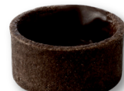
108343 Small Round Jet Black Tart 1.7" Atelier 1/216 ct