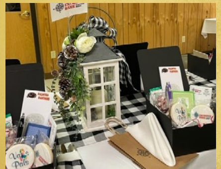
EXCHANGE BANK & VALS PALS TABLE SPONSOR