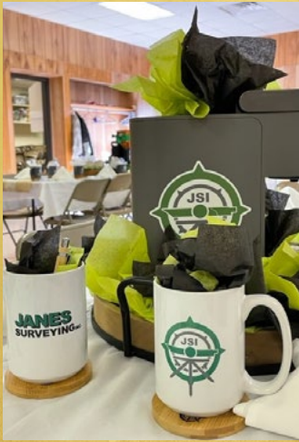
JANES SURVEYING TABLE SPONSOR