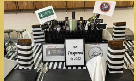
MARK TWAIN TITLE & REBEL PIG TABLE SPONSOR