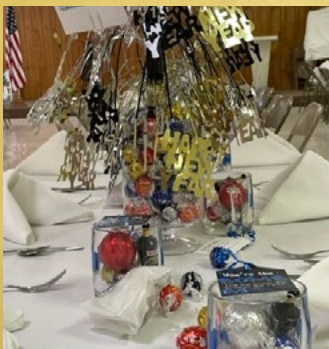
MERCANTILE BANK TABLE SPONSOR