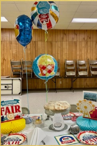
PALMYRA CHAMBER TABLE SPONSOR