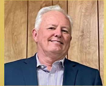
GDC INSURANCE PAINTBRUSH AWARD