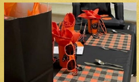
PALMYRA R-1 TABLE SPONSOR