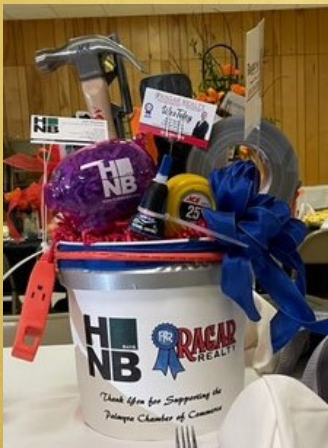
HNB & RAGAR REALTY TABLE SPONSOR