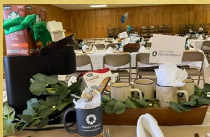
HANNIBAL REGIONAL HOSPITAL TABLE SPONSOR