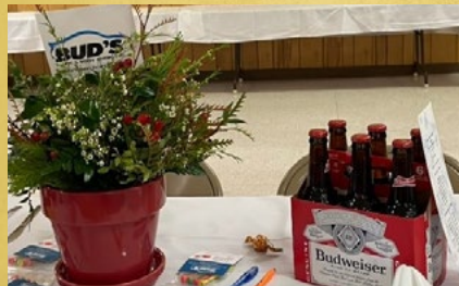
BUD'S TABLE SPONSOR