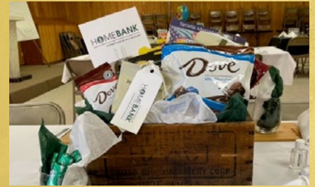
HOMEBANK TABLE SPONSOR