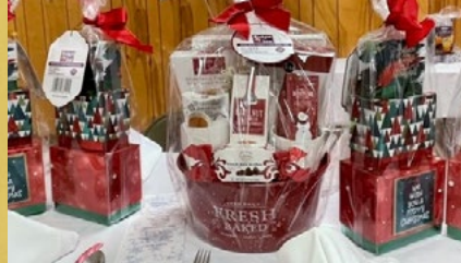
BUDGET INN TABLE SPONSOR