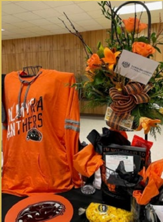
LEWIS BROTHERS TABLE SPONSOR