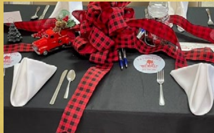
B&S INSURANCE TABLE SPONSOR