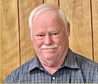
B&S INSURANCE BUSINESS HALL OF FAME

B&S Insurance was inducted into the Business Hall of Fame. Awardees are community businesses which have greatly impacted Palmyra for an