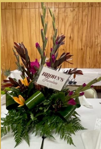
BROWN'S TABLE SPONSOR

SPECIAL THANKS TO OUR CHAMBER BANQUET TABLE SPONSORS