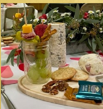
HATS TABLE SPONSOR