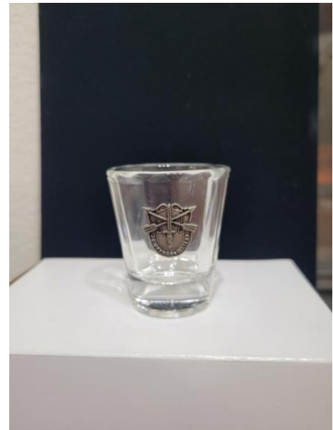
DOL SF CREST SHOT GLASS $7.00 each plus $8.00 postage