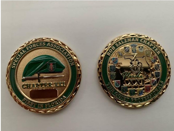
SFA CHAPTER 21 COIN $15.00 plus $8.00 postage

Make checks payable to SFA Chapter 21 Mail your order and checks to: Susan Micelli, 4243 McCorvey Rd, Deland, FL 32724