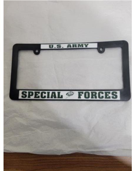
SF LICENSE PLATE FRAME 7.00 each plus $8.00 postage