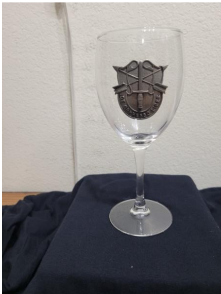
DOL SF CREST WINE GLASS $15.00 each plus $8.00 postage