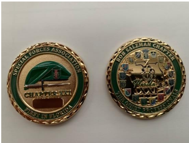
New SFA Chapter 21 Challenge Coin $15.00 each plus $8.00 postage