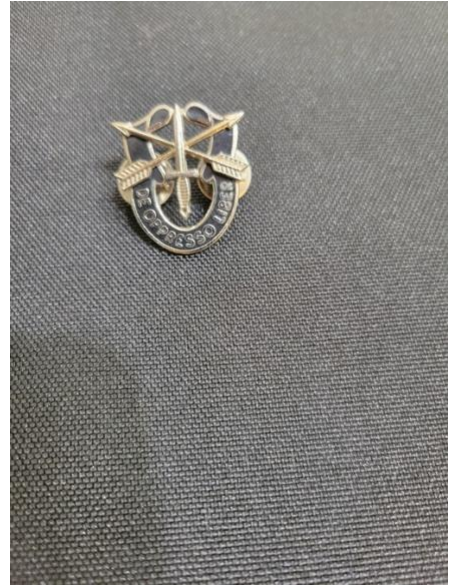
DOL Lapel Pin 6.00 each plus $5.00 postage