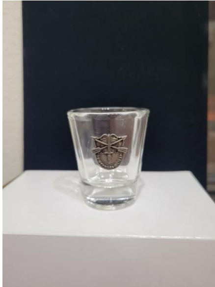
SF DOL Shot Glass $7.00 plus $5.00 postage

Make checks payable to SFA Chapter 21 Mail your order and checks to: Susan Micelli, 4243 McCorvey Rd, Deland, FL 32724