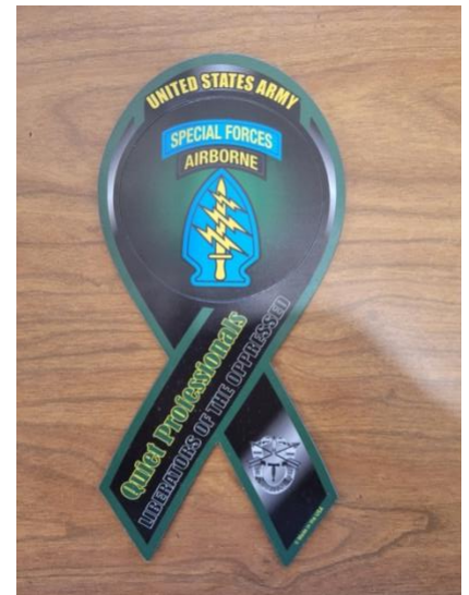
Special Forces Car Magnet $3.00 each plus $3.00 postage