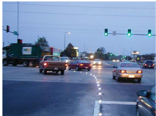
FIGURE 19 Multiple-turn lane IPM system application, Springfield, Illinois (Courtesy: SmartStud Systems).

In 2004, the Illinois DOT (IDOT) installed an IPM system at the intersection of Wabash Avenue at Veterans Parkway in Springfield, Illinois (see Figure 19). The IPM system was intended to provide a more permanent means to delineate the