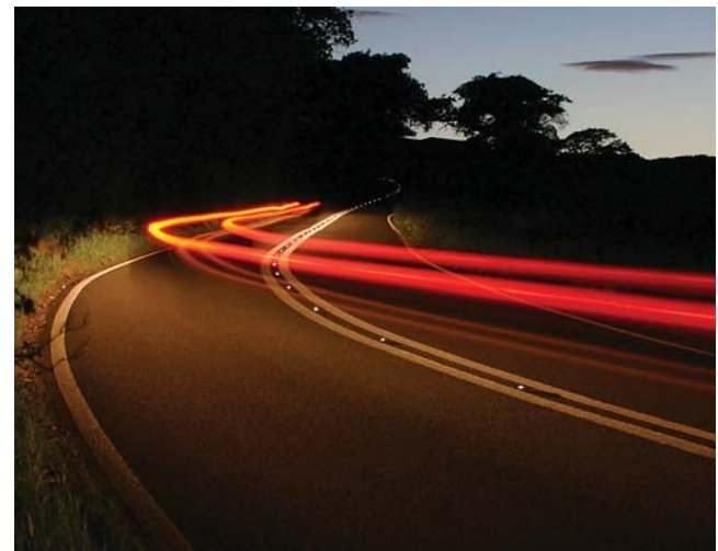
FIGURE 17 Horizontal curve IPM system application, Wales, United Kingdom (Courtesy: Astucia Traffic Safety Systems).

In a laboratory setting in Australia, Styles (2004a) considered the activation performance of environmentally triggered IPM systems. Thirteen light-sensitive, five temperature-sensitive, and seven moisture-sensitive markers were tested according to their response to fading light, fog, and low temperature. Based on these tests, it was noted that the markers will perform their intended illuminating tasks: (1) before ice formation, (2) upon formation of moisture on their surface, and (3) in advance of light intensity levels falling below levels that are present with good street lighting.