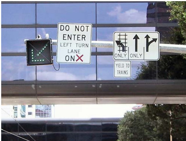
FIGURE 34 Active “Arrow” for permitted access left-turn lane, Houston, Texas.

lane in both the northbound and southbound directions. The markers are spaced approximately 5 ft apart and extend from the beginning of the left-turn bay through the Dryden intersection. The system is activated in a steady-burn state when the dynamic lane control assignment indicates a “Red X.”