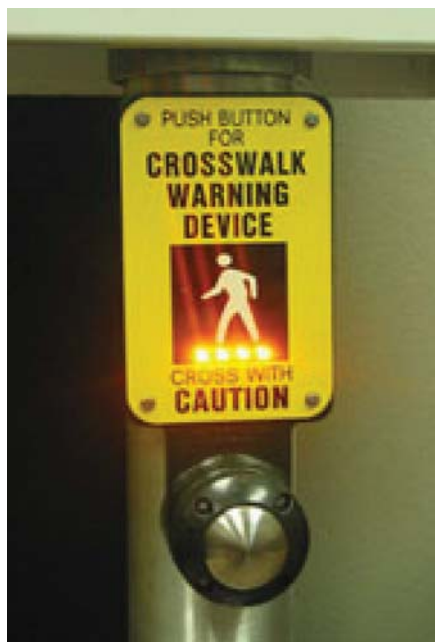
FIGURE 1 Push-button activation system for smart crosswalks (Courtesy: LightGuard Systems, Inc.).

Manual activation is most commonly achieved, particularly for pedestrian crosswalk applications, through a push-button system. An example of a manual push-button system is provided in Figure 1. Signage is placed in proximity to the push button to alert the pedestrian that action is required to activate the system. Although push-button systems are often favored by public agencies because of their low cost, it was anecdotally reported that pedestrians will only use a push-button system 60% of the time (M. Harrison, personal communication, July 2007). Additionally, the use of a push-button system makes pedestrians more aware of the system, possibly giving the pedestrian a false sense of security when crossing the roadway.