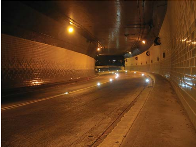
FIGURE 24 Wilson Tunnel (inside the tunnel), Route 63, Honolulu, Hawaii ( Courtesy: Hawaii DOT ).

the IPM system was to provide lane guidance and reduce crashes; the system provides a guidance and warning function both inside the tunnel and outside at the tunnel exit.