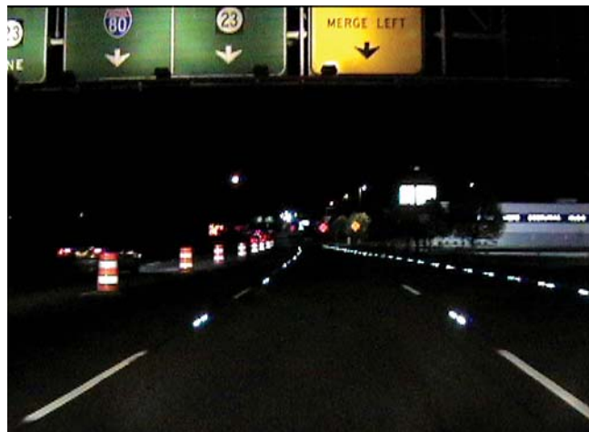
FIGURE 22 Merge location IPM system application (taper view), Wayne Township, New Jersey.