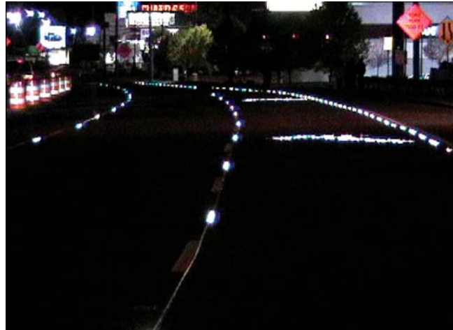
FIGURE 20 Merge location IPM system application, Wayne Township, New Jersey.

Installation issues have challenged the effective operation of this IPM system. The general roadway contractor was not familiar with either the IPM product or installation procedures. Channels to house the cables connecting the markers were not placed deep enough into the pavement, eventually exposing the cables to traffic and the environment. This led to early cable fatigue and failure and subsequent whole system failures. Challenges also existed related to the design of the “merge” arrow as road users had difficulty determining