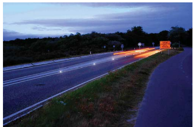
FIGURE 40 Environmentally sensitive area IPM system application, Province of Noord-Holland, the Netherlands.

The Dutch reported a 99.2% savings in energy and minimal impacts on wildlife as a result of the IPM system. In addition, no fatalities or injuries have been reported since the installation of this system. No information was provided, however, regarding safety levels before IPM system implementation to