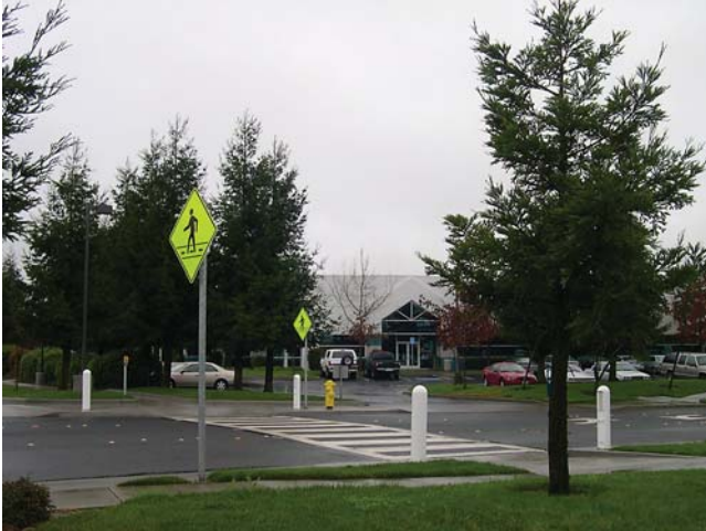
FIGURE 3 Bollard motion sensor activation system.

to cross. These systems are more commonly used to detect vehicles on traffic signal approaches. To date, their use for IPM system activation has been limited.