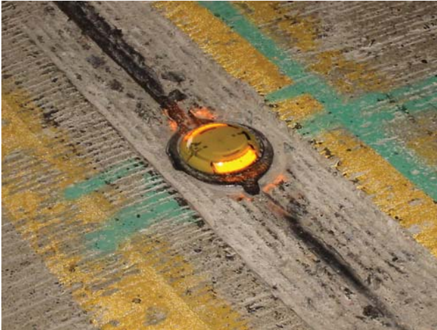
FIGURE 27 Tunnel IPM system application (milled pavement view), between Newhalem and Diablo, Washington (Courtesy: WSDOT).

markers hinder their visibility over time. To date, there have been no reported failures with the markers or system. Failure detection does not occur automatically, but is detected through inspection by the WSDOT maintenance crews or through motorist notifications. The total system cost was estimated as $100,000. Ongoing annual costs associated with system maintenance are approximately $1,000. The operation and safety of the facility have improved with the addition of the IPM, WSDOT believes, although no formal evaluation is available (G. Baghai, personal communication, Aug. 3–7, 2007).