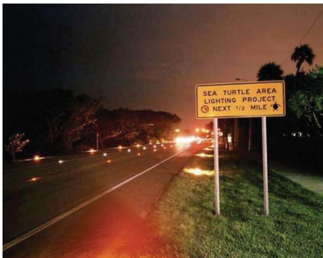
FIGURE 39 Environmentally sensitive area IPM system application SH A1A Boca Raton, Florida.

Although no IPM system costs were directly reported, a resurfacing project is planned for SR A1A that will provide continued use of the existing half-mile IPM system and extend the system for an additional half-mile. The cost of the combined resurfacing/IPM system project is $500,000 (A. Broadwell, personal communication, July 26, 2007).