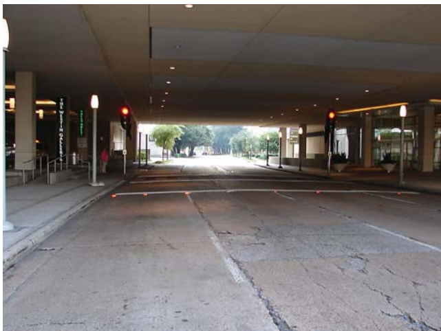
FIGURE 30 Stop-bar application Red Phase, Alabama Street at Galleria, Houston, Texas.

In 2006, The Houston Metropolitan Transit Authority of Harris County, Texas (METRO) implemented an IPM system at an intersection stop bar in the Houston central business district, specifically at the intersection of Jefferson Street and Main Street (see Figure 31). Only the Jefferson Street approach was initially equipped with the IPM system. Jefferson Street is a five-lane, one-way, eastbound street that intersects the METRORail line at Main Street. The motivation for this implementation was to increase road user awareness of the traffic