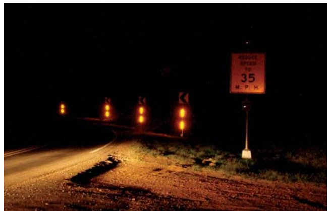
FIGURE 12 Horizontal curve IPM system application (night), Mount Pleasant, Texas.

The Texas DOT (TxDOT) had a problematic horizontal curve on Farm-to-Market (FM) 127 outside of Mount Pleasant, Texas. The curve is in a rural area with no safety lighting; road users were frequently leaving the road and running into traffic control devices intended to warn the driver (e.g., chevron signing along the curve). To enhance curve delineation, IPM system markers were mounted on the chevron sign posts (a hole was drilled in the chevron's pipe and the marker was bolted to the post using antitheft bolts) (see Figures 11 and 12).