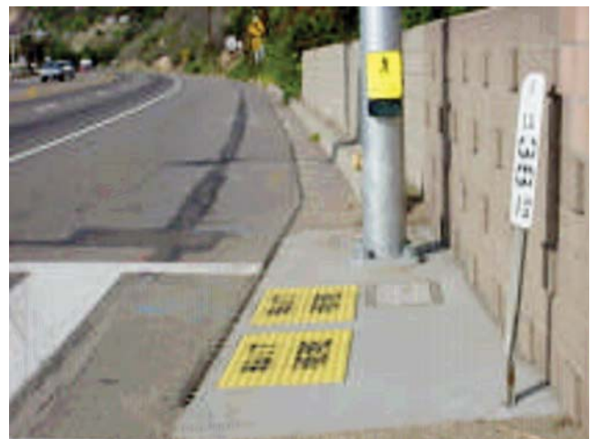
FIGURE 2 Pressure mat activation system (Courtesy: SmartStud Systems).

VIVDS, capable of sensing a change in the background image of a particular view, provide a more sophisticated passive activation system. In pedestrian crossing applications, a sensor detects a change in pixel configuration when a pedestrian enters the viewfinder of a video detection unit. This subsequently alerts the IPM system that a pedestrian is waiting