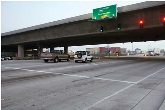
FIGURE 18 Multiple-turn lane IPM system application, Stockton, California (Courtesy: Caltrans).

The IPM system is activated during the left-turn phase of the traffic signal. The markers define the lane line of the two left-turn lanes and illuminate in a forward chase sequence, giving road users a sense of motion and providing positive directional guidance. The markers remain illuminated until the entire curve is lit; the chase sequence then repeats. The