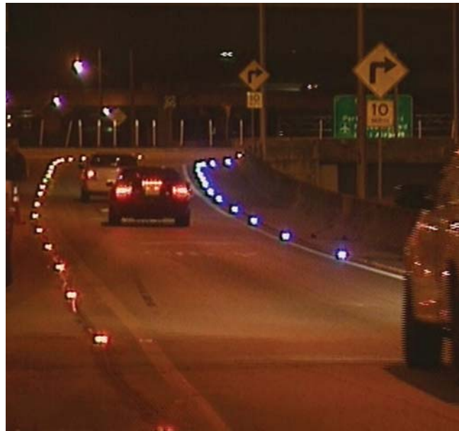
FIGURE 9 Horizontal curve IPM system application, Fort Lauderdale, Florida.

speed. As the driver slows, the chase sequence slows. The IPM system markers extend through the entrance to SR 84 to provide added warning of the curvature at this location (G. Soles, personal communication, July 26, 2007).