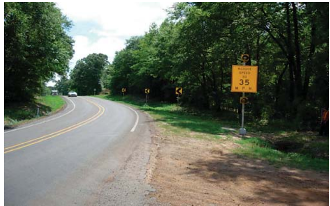
FIGURE 11 Horizontal curve IPM system application (daylight), Mount Pleasant, Texas.

Each marker cost approximately $55, with a total of 13 units installed ($715) and installation was performed by South Carolina DOT (SCDOT) personnel. The IPM system is likely too new (installed one month ago at the time of this report) to report any operational or maintenance related issues or to provide substantive perceptions of effectiveness. Personnel from SCDOT did indicate that 2 of the 13 chevron signs on the curve have been hit by vehicles since the recent installation of the IPM system. No information was provided regarding the frequency of crashes prior to IPM system installation for comparison (A. Leaphart, personal communication, July 2007).