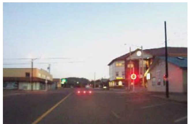
FIGURE 28 Intersection stop-bar IPM system application, Coquille, Oregon.

Under FHWA's experimental designation, an IPM system was implemented at a signalized pedestrian crossing that connects two sections of the Galleria Mall at West Alabama Street. The IPM system is illuminated during the yellow and red phases of the traffic signal and matches the signal's color indications. The markers used in this application have five amber LEDs and five red LEDs. When the traffic signal provides a yellow indication, the amber LEDs illuminate in a steady-burn state (see Figure 29). When the traffic signal provides a red indication, the red LEDs illuminate, also in a steady-burn state (see Figure 30). When the traffic signal shows a green indication, the IPM system is deactivated.