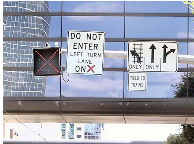
FIGURE 33 Active "X" for do not enter left turn lane on X, Houston, Texas.

A segment of Houston's METRORail light rail is centered on Fannin Street running in the former median portion of the roadway. Along this corridor, left-turn movements are prohibited in both northbound and southbound directions along Fannin Street (within the Texas Medical Center) when a train is approaching. Despite this left-turn restriction, a number of crashes have occurred involving left-turn movements by road users. To reinforce the turn restriction, Houston METRO first installed a dynamic lane control assignment system (see Figures 33–35). A "Red X" indicates that left-turn movements are prohibited; a "Green Arrow" indicates that left-turn movements are allowed and a "Train Approaching" sign provides additional warning to road users ("METRORail . . ." 2007). These overhead-