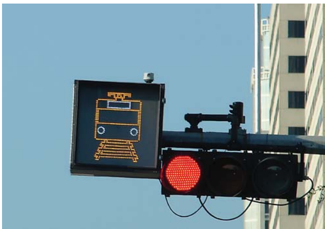
FIGURE 35 Train approaching sign (flashes on train approach).

Not unique to this application, power supply issues were encountered early in IPM system operation but have since been resolved. On more than one occasion, the system was without power owing to a suspected manufacturing defect in the power supply. Also, marker adhesion has been problematic; some markers were dislodged from the pavement and were lost or destroyed by traffic. Once the missing markers were replaced with stronger adhesive, the system has operated with few to no problems (W. Langford, personal communication, 2007).