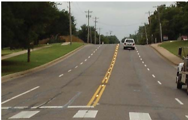
FIGURE 5 School zone IPM system application in Edmond, Oklahoma (Courtesy: SmartStud Systems).

communication, July 2007). Amber lights were used to delineate the left edge, placed just beyond the edgeline, and white lights were used to delineate the right edge, also placed just beyond the edgeline. The lights operated in a steady-burn mode (Meyer 2000a, b).