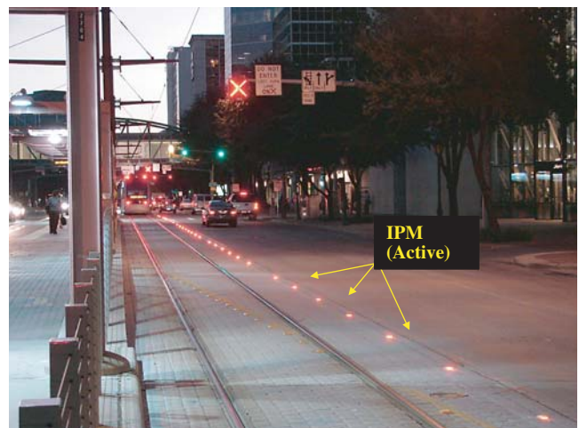
FIGURE 37 Left-turn restriction IPM system application (active), Houston, Texas.

Conducted simultaneously with the previously described driver comprehension studies for IPM system intersection stop-bar applications, the driver comprehension studies for this application were conducted in April 2006 with 103 individuals who drive in and around Houston and, specifically, the Texas Medical Center. The participants were shown a selection of video clips (some of which contained computer-animated renditions of the proposed IPM system in the active state) and asked to complete a survey after they viewed the videos. These comprehension studies were completed before the IPM system was activated on Fannin Street. The results of this