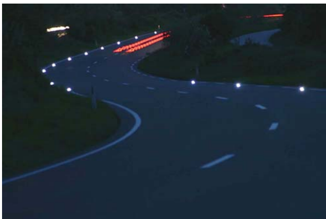
FIGURE 16 Horizontal curve IPM system application, Province of Noord-Holland, the Netherlands (Courtesy: Astucia Traffic Safety Systems).

Limited information was available regarding an IPM system implemented in the Province of Noord-Holland along N200 in the Netherlands. N200 is a four-lane, divided roadway characterized by a high degree of curvature. IPM system markers are installed on the outside edge of each curve (see Figure 16). The benefits of this system are purported to be increased safety and an energy reduction of more than 90% when compared with conventional overhead illumination (Astucia Traffic Safety Systems 2007b).