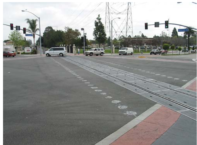
FIGURE 7 At-grade highway–rail crossing IPM system application, Paramount, California.

For this application, the IPM system was originally approved by the California Public Utilities Commission and FHWA as a demonstration project. The system cost between $55,000 and $60,000.