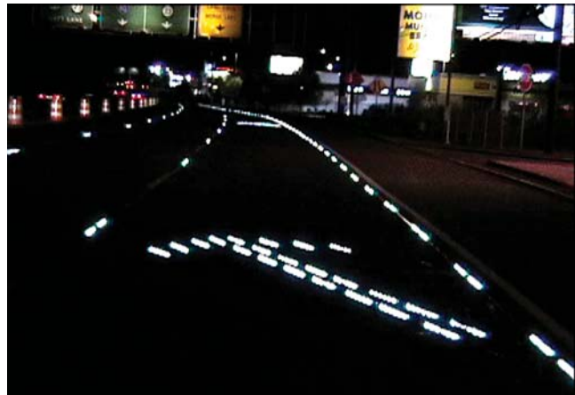
FIGURE 21 Merge location IPM system application (arrow view), Wayne Township, New Jersey ( Courtesy: HIL-Tech, Ltd. ).