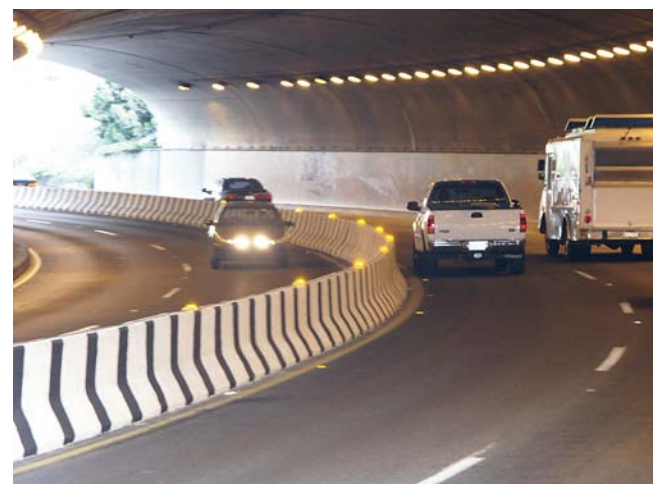
FIGURE 23 Tunnel IPM system application, Santa Monica, California (Courtesy: SmartStud Systems).

In May 2006, the Hawaii DOT (HDOT) implemented an IPM system in the eastbound Wilson Tunnel on Route 63 outside of Honolulu (see Figures 24 and 25). The intention of