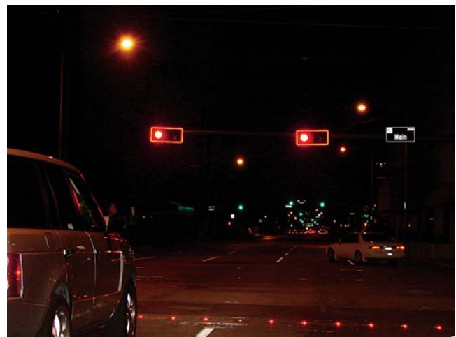
FIGURE 32 Intersection stop-bar IPM system with LED-bordered backplates, West Gray Street at Main Street, Houston, Texas.

Most recently, Houston METRO has implemented several additional IPM systems at intersection stop bars (as well as LED-bordered backplates) along Main Street and the light rail line. Two different types of IPM systems were used across these locations, requiring different installation techniques, power delivery methods, and operating modes (i.e., flashing).