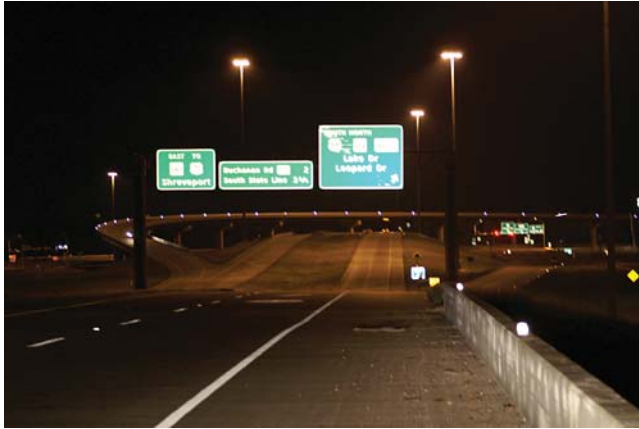
FIGURE 15 Horizontal curve IPM system application (aesthetic view), Texarkana, Texas (Courtesy: TxDOT Atlanta District).

A formal evaluation of the effectiveness of this IPM system has not been done. Anecdotally, TxDOT personnel report fewer tire marks on the barriers at this location than before. Additionally, TxDOT personnel believe that the markers add to the aesthetics of the flyover (see Figure 15) (C. Ibarra, personal communication, Aug. 3, 2007).