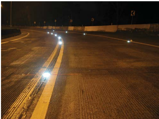
FIGURE 25 Wilson Tunnel (exit from the tunnel), Route 63, Honolulu, Hawaii.

To date, there have been no reported failures with the markers or system. Failure detection does not occur automatically, but is detected through inspection by the HDOT maintenance