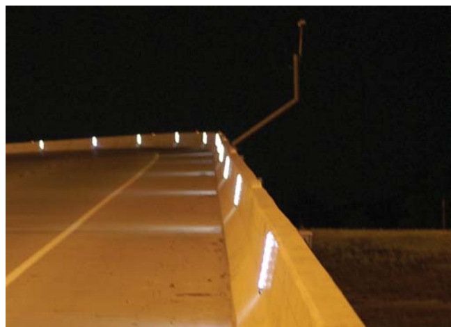
FIGURE 14 Horizontal curve IPM system application, Texarkana, Texas.

The IPM system at this location has experienced some challenges since implementation, but TxDOT is working with the manufacturer to remedy issues with the system. One challenge with this installation was the physical length (one-half mile) and the power requirements of each marker. Each marker requires 21 volts to operate, and ensuring enough voltage is available to illuminate the last sets of markers along the line was difficult because of power consumption along the cable. In response, the manufacturer developed special power reduction modules that adjust the initial 33-volt input to the required 21 volts per marker. At the end of the half-mile installation, no additional power reduction is necessary to achieve the required 21-volt power. Personnel from TxDOT suggested that this installation would have been easier if a power supply had been provided at each end of the line. The IPM system cost $56,000 for an approximate half-mile length of roadway, which included equipment and installation.