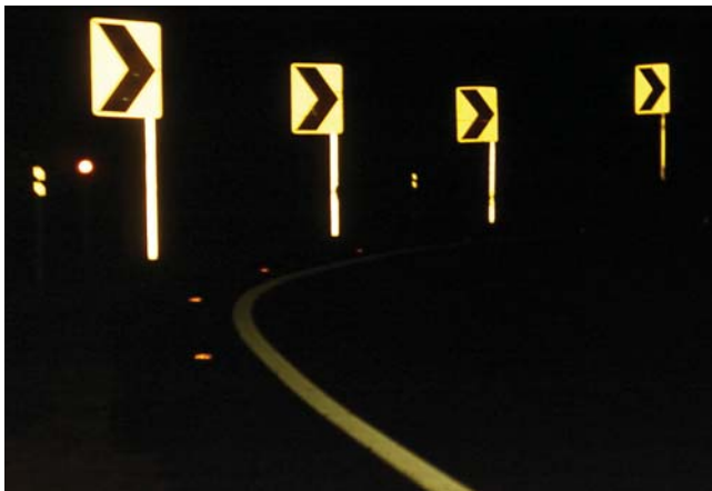
FIGURE 10 I-126 at Greystone Boulevard, Columbia, South Carolina.

For a distance of 200 ft, IPM system markers were attached directly to the surface of the roadway using butyl pads. The markers consist of two LEDs for illumination, but also provide passive guidance through a reflectorized lens (similar to an RRPM). The IPM system is solar-powered; each marker is activated internally by a photocell and operates during low-light times. Once activated, the units flash at a rate of approximately 60 to 80 times per minute.