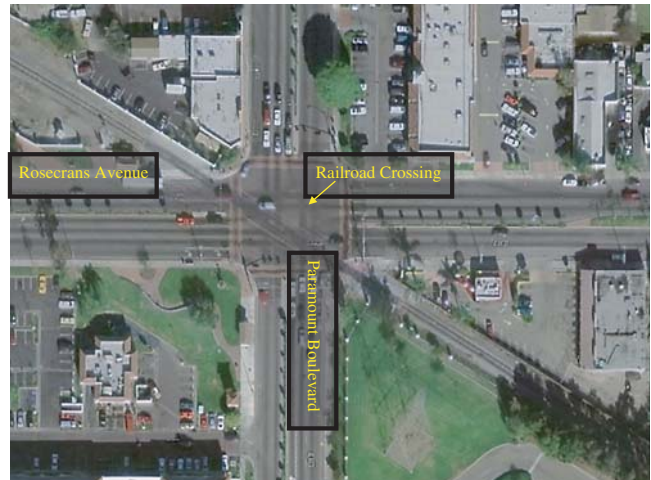
FIGURE 6 Paramount Boulevard at Rosecrans Avenue, Paramount, California.

The rail line is a spur trap that services a refinery, with trains crossing once or twice per day (i.e., a daily delivery in and out). The trains do not travel at high speeds, but rather at approximately 5 mph. Traffic volumes at the intersection are high; approximately 30,000 vehicles per day eastbound and westbound and 20,000 vehicles per day northbound and southbound. Additionally, there are approximately 400 high school and middle school students who walk through this intersection each day.