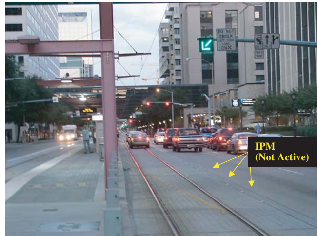
FIGURE 36 Left-turn restriction IPM system application (not active), Houston, Texas.

As with the previous IPM system applications in Houston, Texas, this IPM system was implemented with FHWA’s experimental approval. As part of this process, semi-annual reports are required to document the effectiveness of the application under experiment. The first report provided information on driver comprehension, traffic operations (including violations of the prohibited left-turn maneuver), and vehicle crashes.