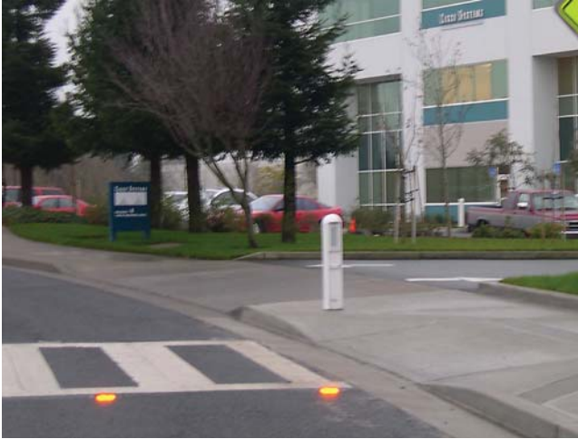
FIGURE 4 “Smart crosswalk system”.

components of: (1) IPMs, (2) an AC or solar power source, and (3) a manual push-button or passive activation system (see Figure 4). Over time, and with expanded IPM system implementation, various installation, operation, and maintenance challenges have been identified.