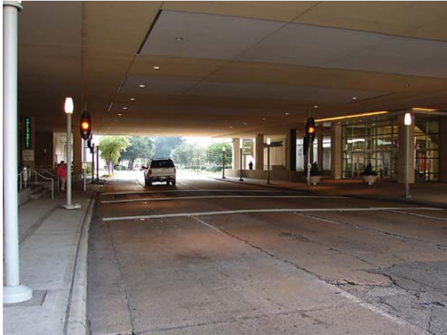
FIGURE 29 Stop-bar application Amber Phase, Alabama Street at Galleria, Houston, Texas.

Initially there were problems with electrical “shorts” in the IPM system; however, this was attributed to initial system wiring rather than equipment failure. Once resolved, few additional maintenance issues were reported. As with other applications, it was noted that the IPM system markers do collect dirt and debris and require occasional high-pressure water cleaning (tunnel-like conditions under the pedestrian bridge prevents rain from self-cleaning the markers) (R. Taube, personal communication, July 23, 2007). Decreased luminous intensity was also noted with the IPM system markers. This is likely attributable to the reduced number of LEDs per illumination phase (i.e., 5 yellow or red LEDs per illumination rather than the more typical 10). The total cost for this IPM system was approximately $45,000, comprising material costs of $30,000 and installation costs of $15,000 (P. English, personal communication, July 23, 2007). The effectiveness of the IPM system at this location was measured at two different times following implementation: (1) initially following system implementation, and (2) following extended implementation