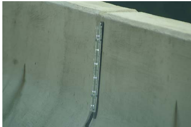
FIGURE 13 Horizontal curve IPM system application (close-up view), Texarkana, Texas.

For this installation, IPM system markers were installed on the right-side concrete barrier of the curve (see Figures 13 and 14). The installation is approximately one-half mile long. The markers were bolted directly to the barrier using antitheft bolts. The IPM system is activated by a photocell and is illuminated when the ambient light begins to dim. Once the system is acti-