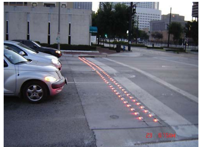
FIGURE 31 Intersection stop-bar IPM system application, Jefferson Street at Main Street Houston, Texas.