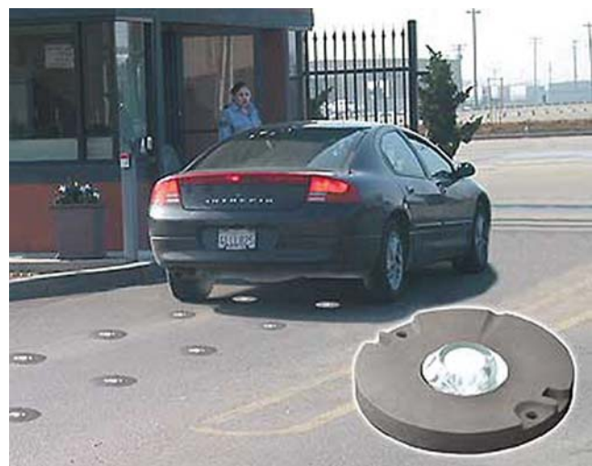
FIGURE 38 Vehicle and truck inspection point IPM system application.

Light pollution, attributable to conventional overhead roadway lighting systems, has prompted the use of IPM systems as an alternative source of illumination at a number of locations deemed to be environmentally sensitive.