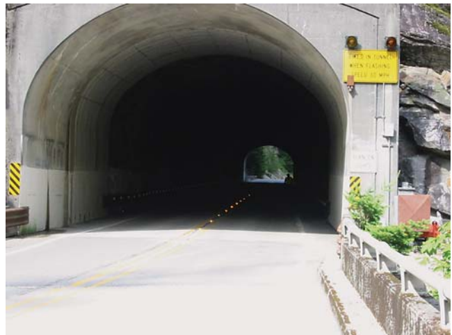
FIGURE 26 Tunnel IPM system application, between Newhalem and Diablo, Washington.

Some maintenance is required to clean the individual markers every three to six months as debris and dirt on the