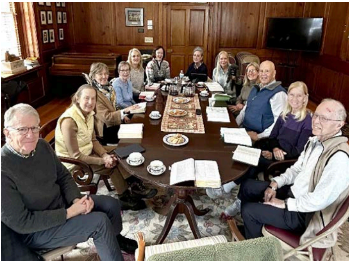
Rector's Bible Study meets on Wednesdays at 11:00 a.m.