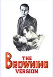
March 8 "The Browning Version" (1951)