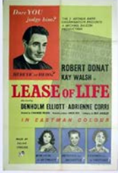
Rescheduled to March 29 "Lease of Life" (1954)