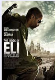
March 15 "The Book of Eli" (2010)