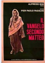
March 22 "The Gospel According to Matthew" (1964)

Tickets and information available at www.bedfordplayhouse.org