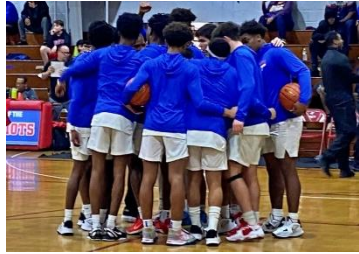
STATE CHAMPIONS 2026 2012