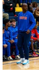
STATE RUNNERUPS 2015 2022