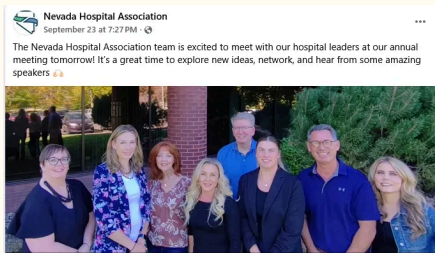
Nevada Hospital Association, NHA staff at the annual conference, September 23-25, 2025, near Lake Tahoe in Nevada