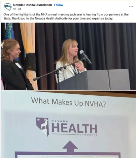
Nevada Hospital Association, 2025 annual conference, introducing their partners at the State of Nevada