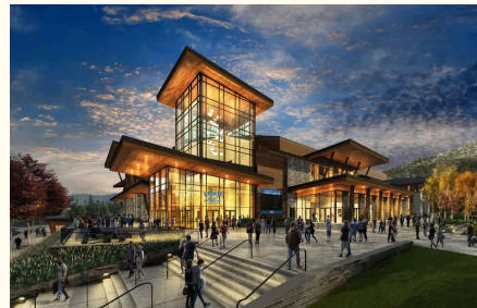
Nevada Hospital Association, Annual Conference, held September 23-25, 2025, at the Tahoe Blue Event Center near Lake Tahoe in Nevada