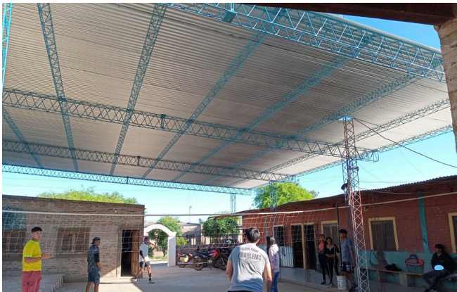
Sonnenberg is also Sayaten. Sayatenberg!

young people also enjoy being in the courtyard more. Any time is a good time to play now. Volleyball never stops. the place is cooler, we have fewer hours of sunshine on our walls. Everything is a joy. Thank you for everything.