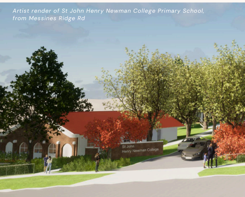
Artist render of St John Henry Newman College Primary School, from Messines Ridge Rd

It is exciting to see this vision for St John Henry Newman College's primary school campus begin to come alive, through beautiful renders of our Stage One and Two development like the one below!