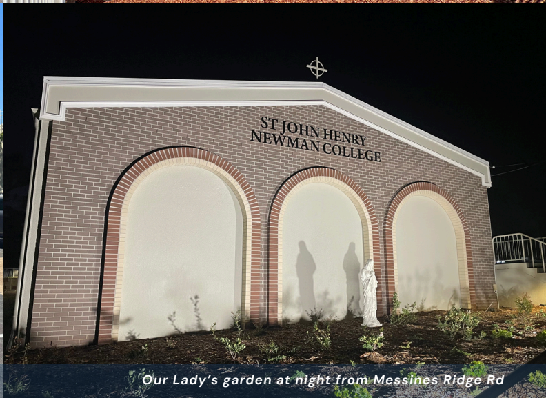
Our Lady's garden at night from Messines Ridge Rd