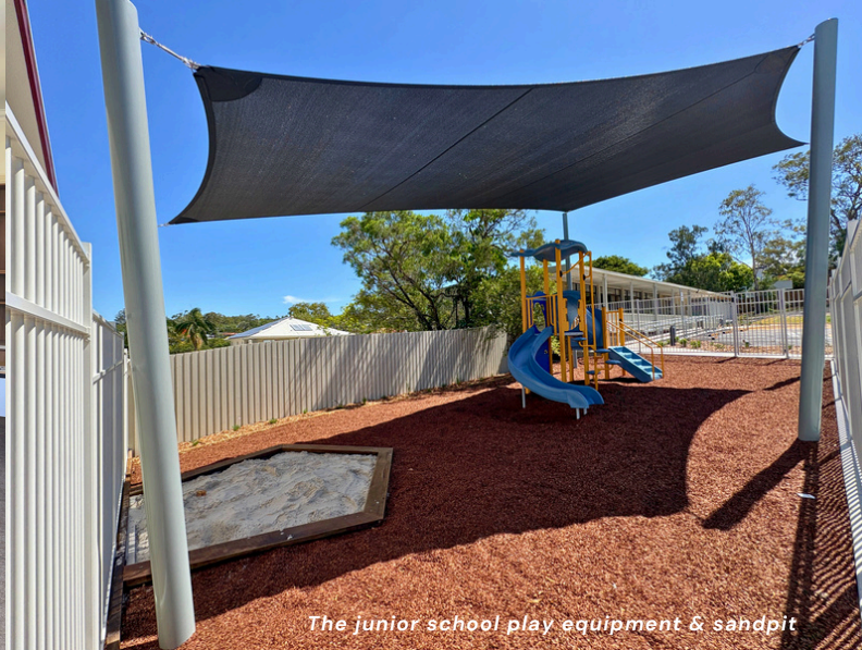
The junior school play equipment & sandpit