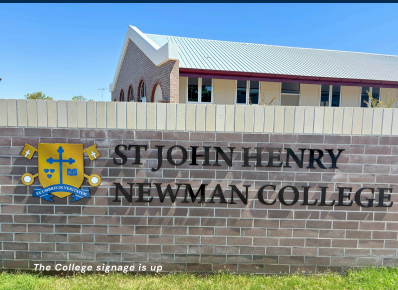
The College signage is up

Over the past six months we have successfully undertaken the first stage of our primary school construction. These essential works are what we needed to complete to open our doors in January 2026.