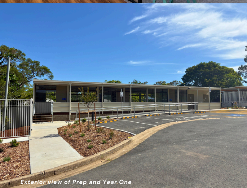
Exterior view of Prep and Year One