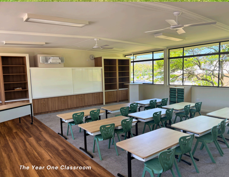
The Year One Classroom