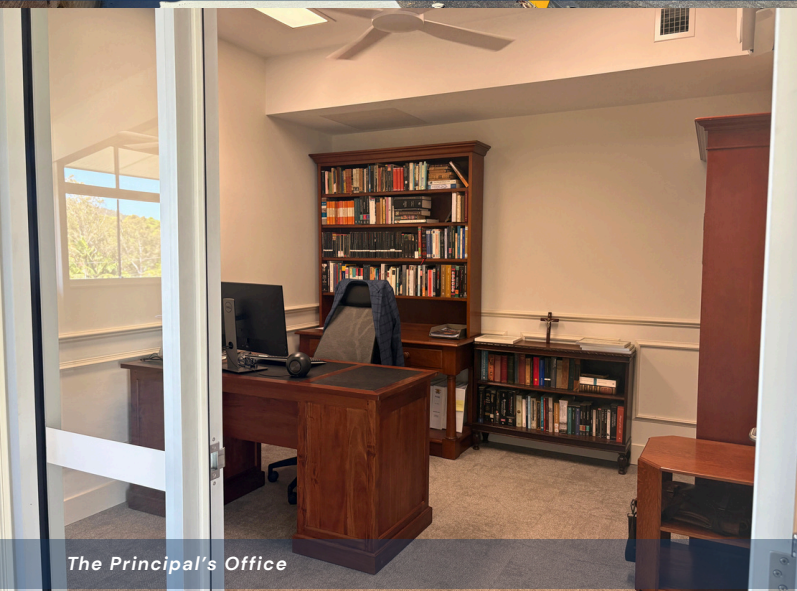
The Principal's Office