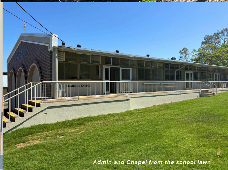
Admin and Chapel from the school lawn