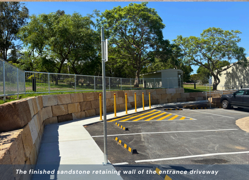
The finished sandstone retaining wall of the entrance driveway