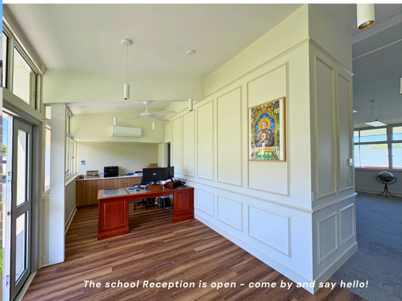
The school Reception is open - come by and say hello!