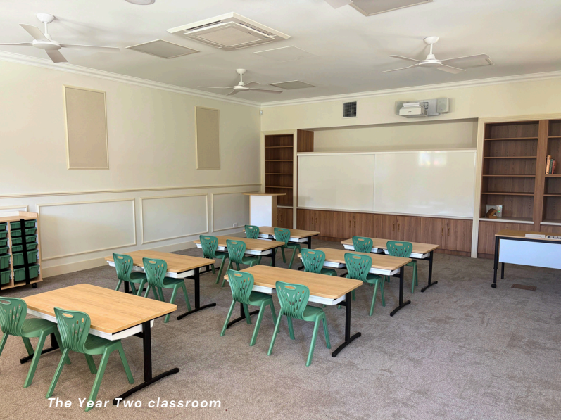
The Year Two classroom