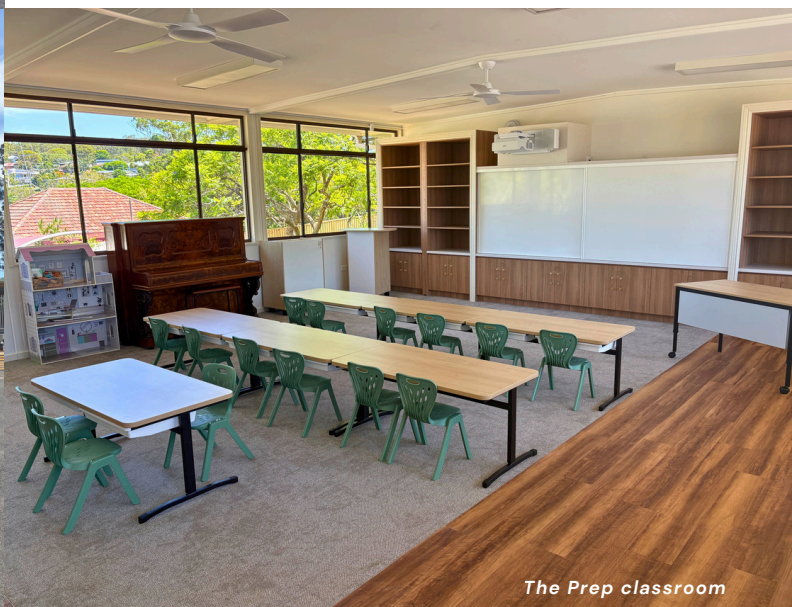
The Prep classroom