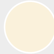
Cream white RAL 9001