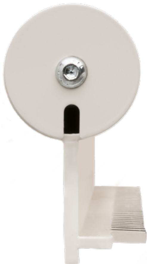
Otolift Modul-Air Smart