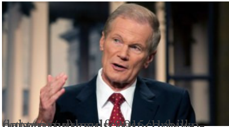
Senator Bill Nelson (D-Florida)

The building’s disrepair has also forced elected officials to relocate staffs elsewhere. U.S. Senator and Republican Presidential candidate Marco Rubio said that he was forced to move his employees out of the courthouse after a pregnant woman began showing symptoms that were consistent of someone exposed to toxic mold.