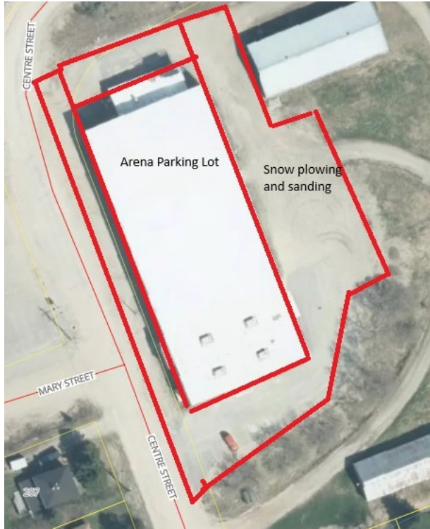
Municipal Parking Lot – Beside Home Hardware (Area shown in red for snowplowing and sanding).