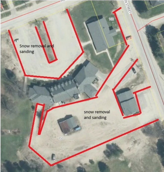
Senior Center and Library parking Lot – 39 Copeland Street/ 136 Yonge Street (area shown in red for snowplowing and sanding).