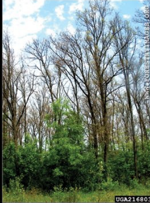
Millions of hardwoods killed by gypsy moth