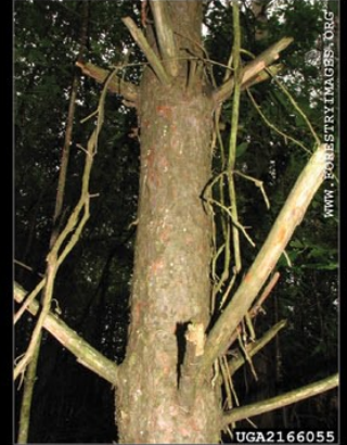
Millions of pines threatened by European wood wasp

Transporting firewood can spread insects and diseases that KILL TREES.