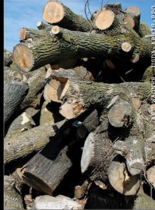
Over 50 million ash killed by emerald ash borer