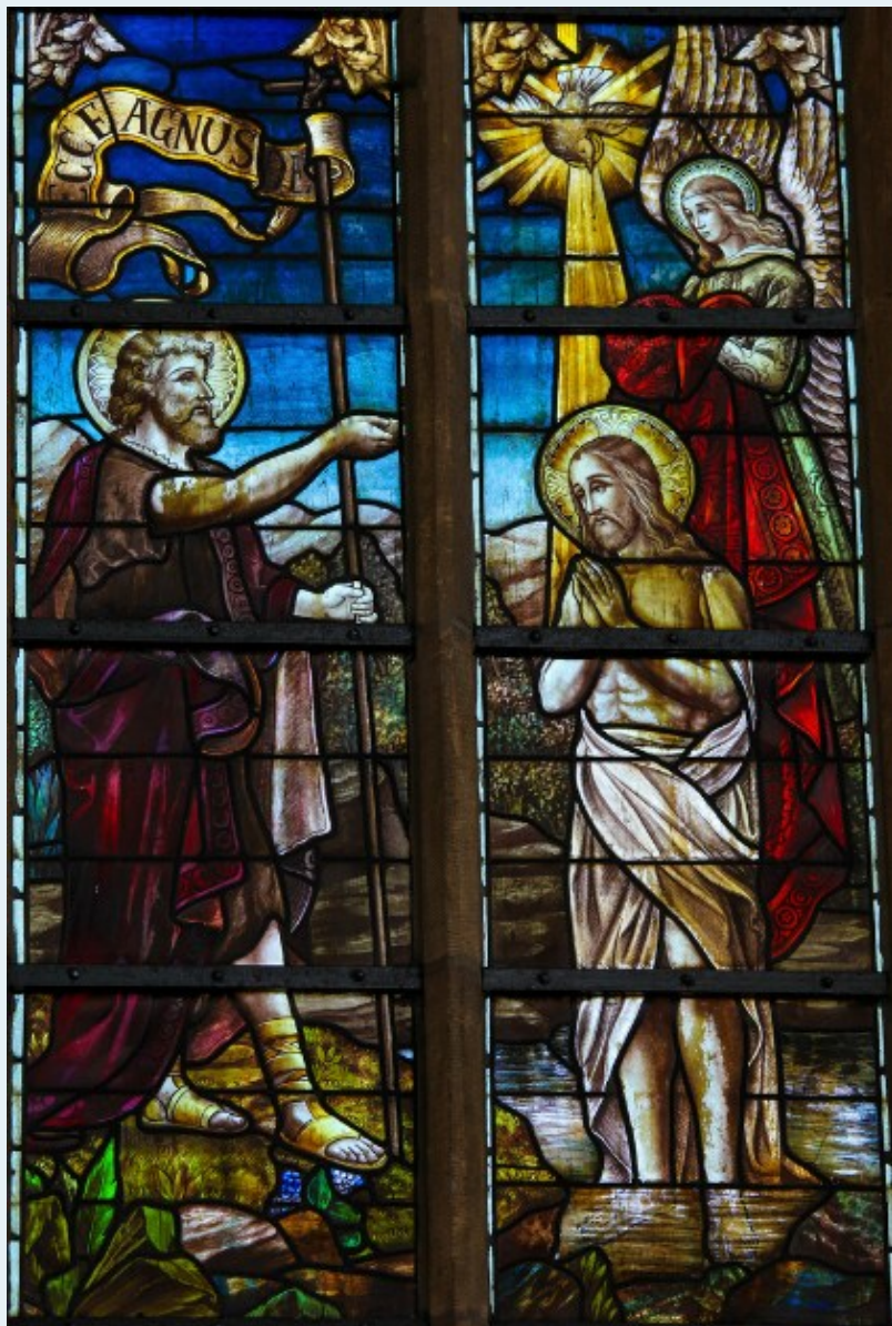
Stained glass window of the Baptism of Jesus by St. John, from over 100 years ago, in the church in Boortmeerbeek, Belgium.