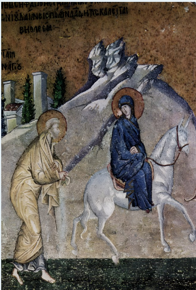
"The Journey to Bethlehem Mosaic", 1320 From the Byzantine/Palaeologan Renaissance