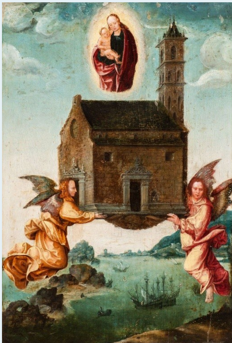
"The Transfer of Mary's House to Loreto", 16th Century, Anonymous Artist