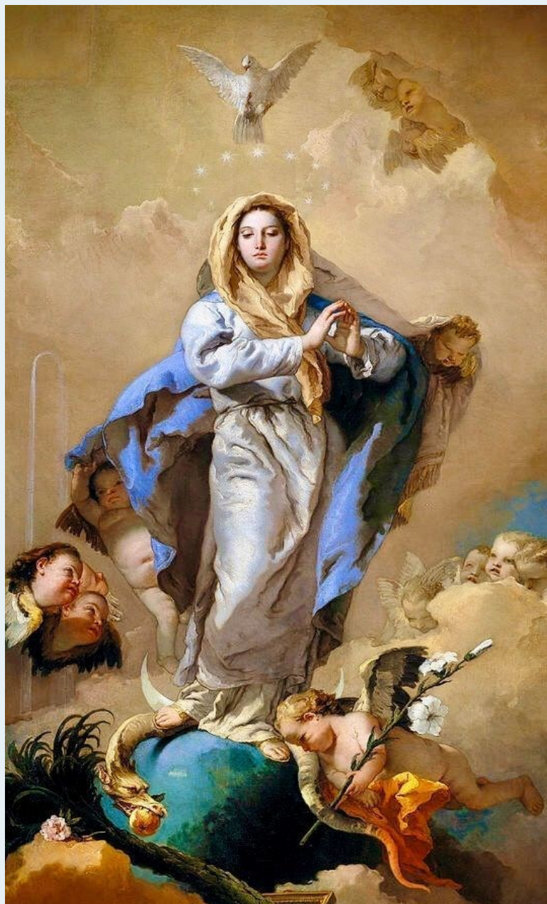
"The Immaculate Conception" by Giovanni Battista Tiepolo, (1696-1770)