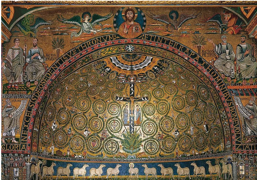
Anonymous Mosaicist c.1130, The Tree of Life, Basilica di S. Clemente, Roma.

The apse mosaic in the Basilica of San Clemente, in Rome, is one of a number of reasons to visit this church (there is also an underground: 4th century church with 11th c. frescoes, and a 2nd century Roman home with a Mithraeum). The Cross of Jesus becomes the Tree of Life, springing up from a clump of acanthus (the leaf that inspired Corinthian columns, and disappears completely in the Winter only to rise up again in the Spring) sending out branches that fill the rest of the gold half-dome, bearing food for the multitude of birds flying and landing among the branches. This is Paradise. Birds are the symbol of the human soul: when in cages or caught in a bramble it is the soul trapped in the sinful human condition, but when flying free represent the soul set free by the death and resurrection of Jesus. Doves on the cross represent the 11 disciples (the 12th stands opposite Mary). The four doctors of the church (Augustine, Jerome, Gregory the Great, and Ambrose) are seated in the branches. Below are the four rivers that flow out of Eden (Tigris, Euphrates, Gihon, and Pishon) where deer and birds drink of the life-giving waters. And below that are a row of sheep. The central one is the shepherd, the Lamb sacrificed for the sheep, with the apostles coming from Jerusalem and Bethlehem.