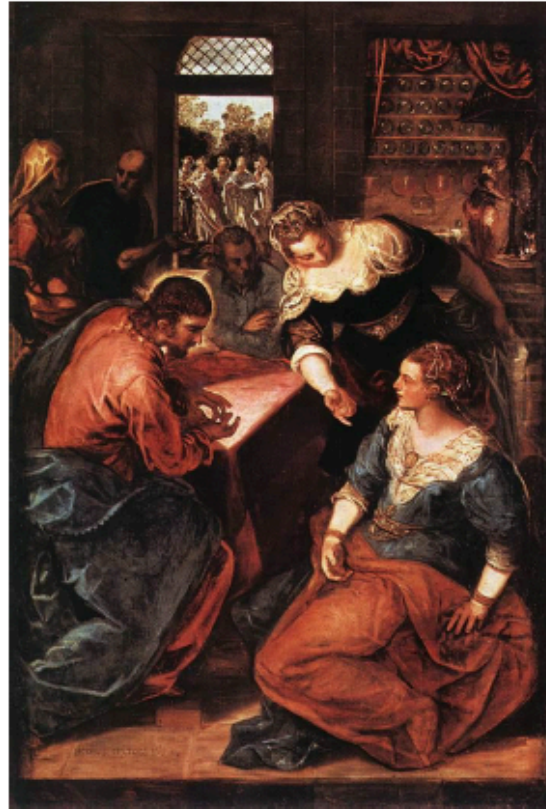
Jesus at the House of Martha and Mary, [Jacopo Robusti] Tintoretto (1518-94)