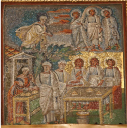
S. Maria Maggiore, Roma, Abraham at Mamre, mosaic (432-440).