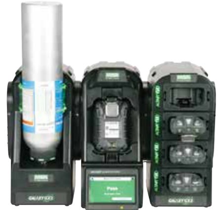
GX2 COMPLETE SET UP