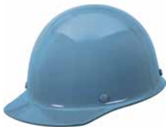
MFR #454623 (CAP STYLE)

Handmade For Durability, Toughness & Quality