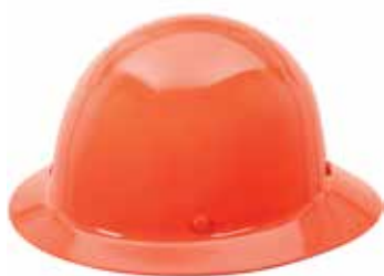
MFR #454673 (FULL-BRIM STYLE)