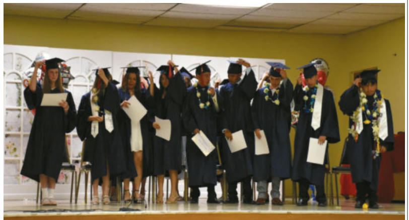
8th Grade Graduation! Congratulations!