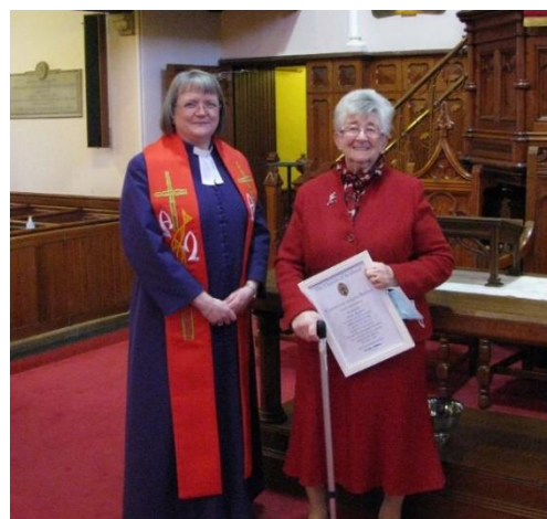
Long Service certificates, Profession of Faith and Ordination of Elder and memories from a few years ago.