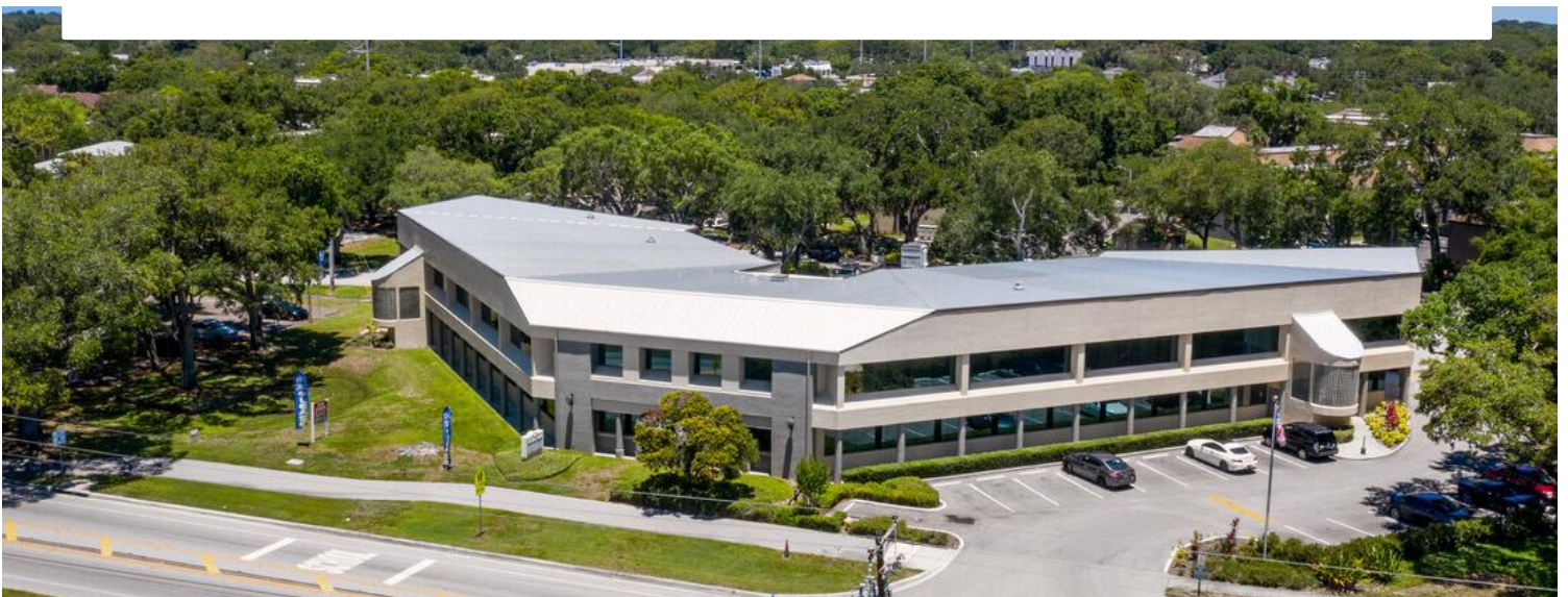
Moore Marine College Facility

The institution is located in the city of Clearwater at 2240 Belleair Road, Suite 204, measuring 3319 square feet. The facility contains two classrooms, three offices, two labs (one biological and one chemical), a conference room, and a break room for both faculty and students. This space will be occupied by on-site Florida staff personnel who will maintain the office and student records for all Moore Marine College students, personnel related to student enrollment and field training experience coordinators that help schedule, manage, and oversee externship performance. Moore Marine College provides its instruction through hybrid methods, using both on-site and online teaching methods.