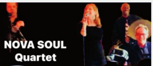
NOVA SOUL Quartet