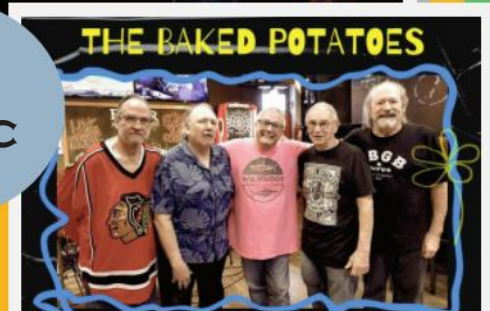
THE BAKED POTATOES