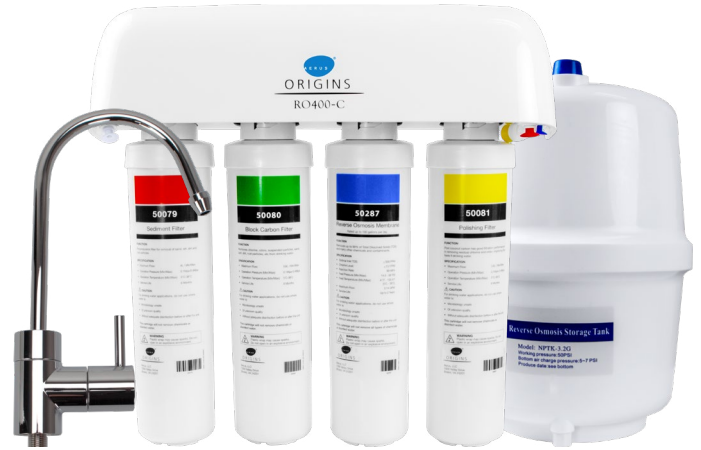
Includes dedicated RO faucet, 3.2 gallon tank and all hardware