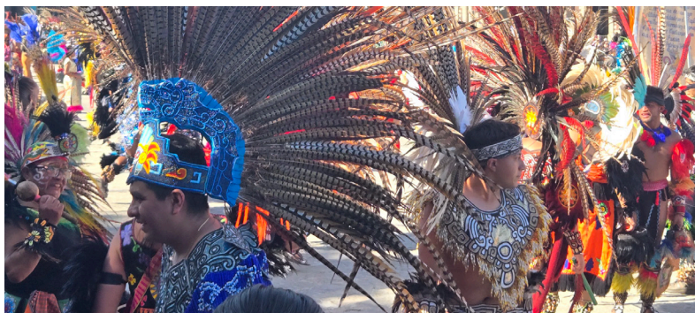
Hundreds of people are dancing to drums in traditional native dress in the plaza in front of the Basilica of Our Lady of Guadalupe in Mexico City.