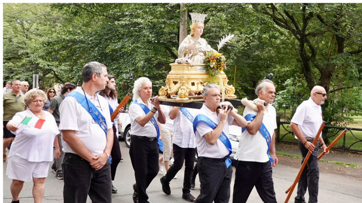
Members of the St. Trofimena Society of St. Michael Church carry a statue of the saint through the Wooster Street neighborhood of New Haven during a procession on her feast day.