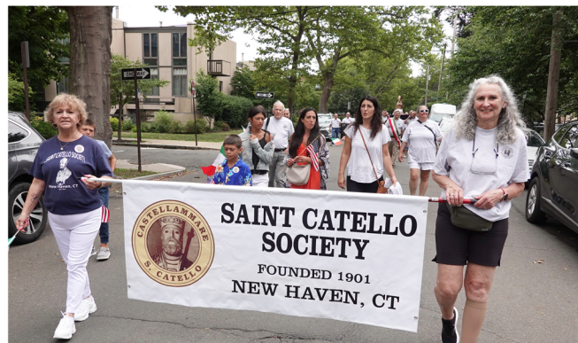
The St. Catello Society participated in the first procession in 70 years, along with other Italian-American religious societies from St. Michael and St. Anthony.

Several hundred Italian-Americans marched in a procession three blocks long in honor of St. Trofimena, a fourth century virgin martyr, whose statue was held aloft on a platform and carried through New Haven's Wooster Street neighborhood of Little Italy.