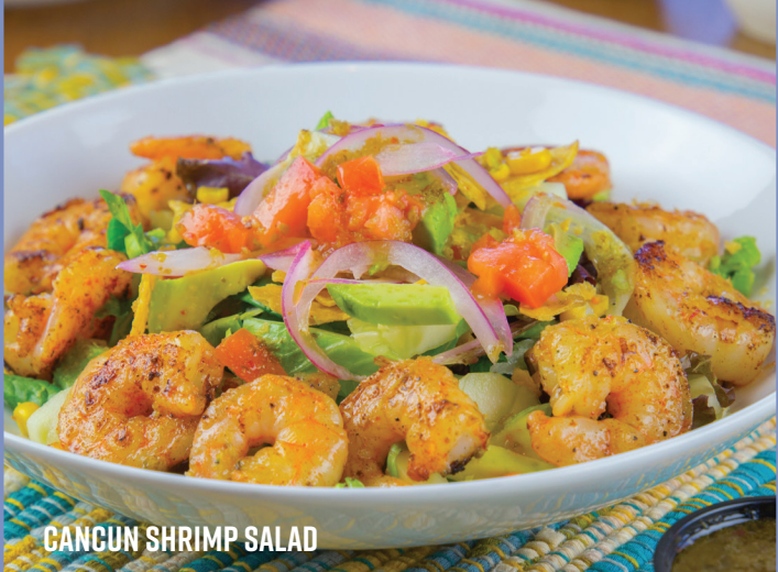
CANCUN SHRIMP SALAD