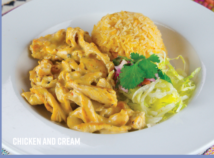
CHICKEN AND CREAM