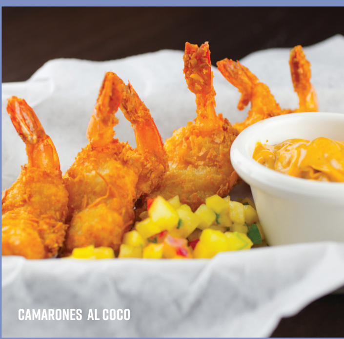
CAMARONES AL COCO