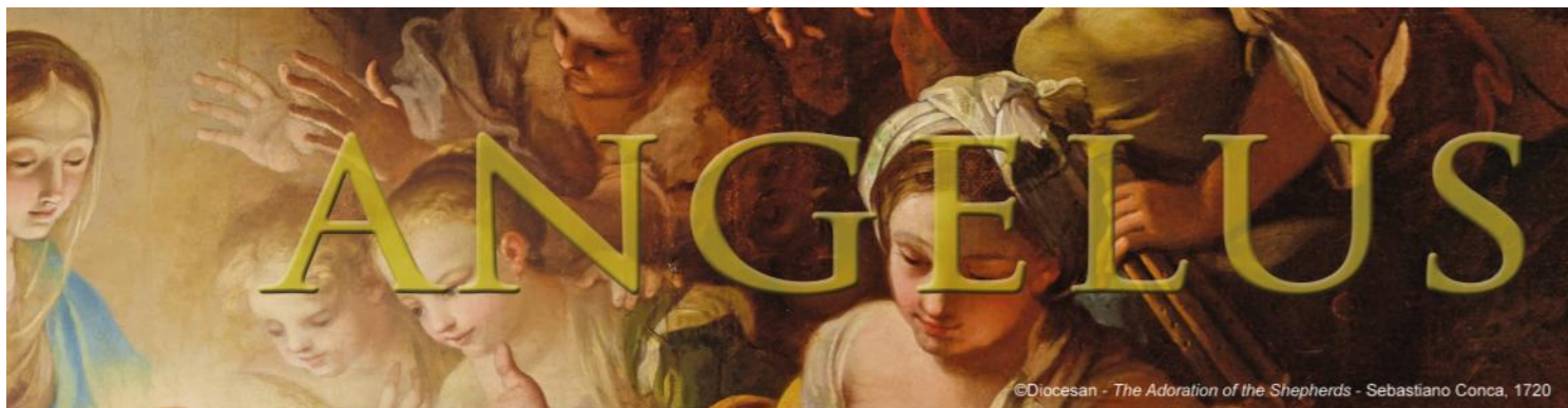
The Adoration of the Shepherds - Sebastiano Conca, 1720