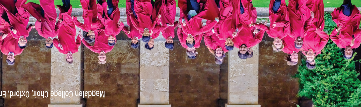
Magdalen College Choir, Oxford, Eng