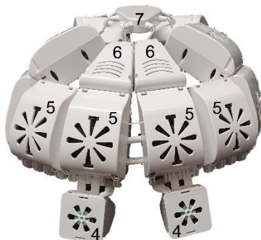
Front view, with eye modules