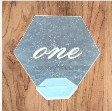
Hexagon Table Numbers