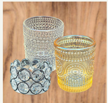
Votive Candle Holders