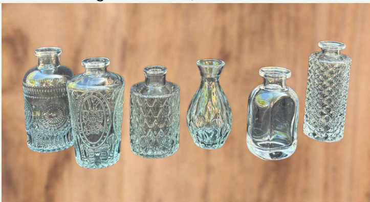
Miniature Assorted Vases Clear