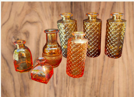
Miniature Assorted Vases Orange and Light Amber