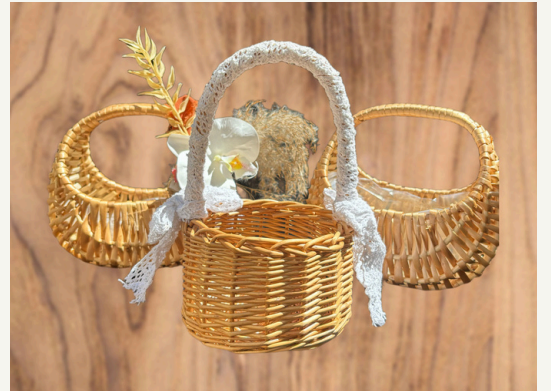
Flower Girl Baskets