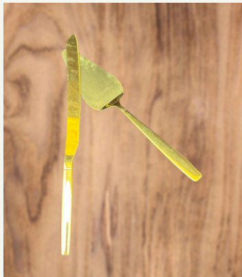
Cake Cutting Utensils