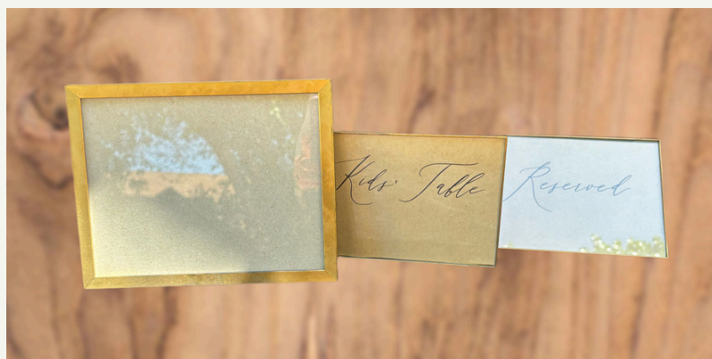
Gold Picture Frames