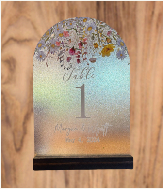
Floral Table Numbers