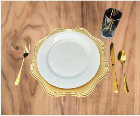
Gold Silverware, Plate, Charger, Drinking Glass