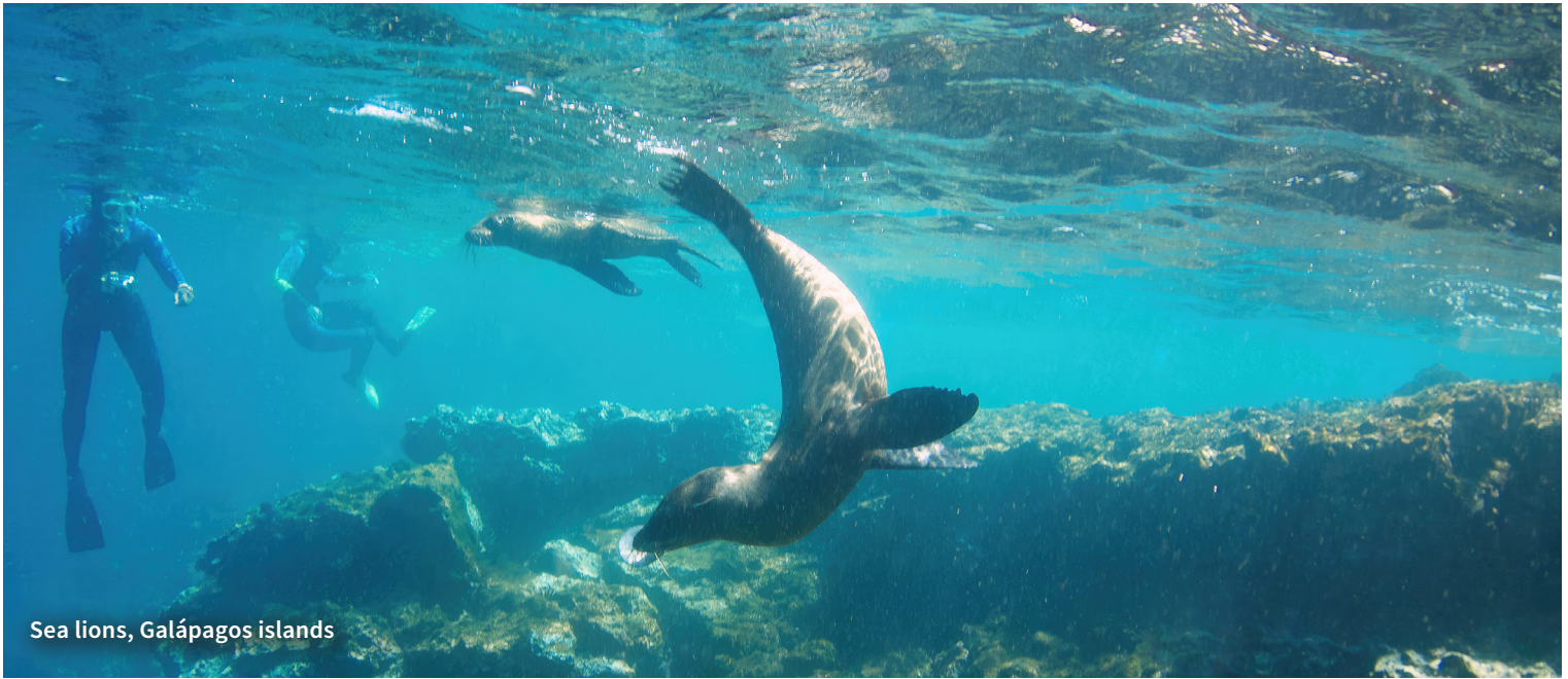
Sea lions, Galápagos islands