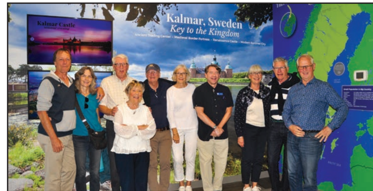
Föreningen Kalmar Nyckel (Friends of Kalmar Nyckel) brought 11 members from Kalmar, Sweden and the U.S. to tour our historic sites and attend the King Neptune Gala.