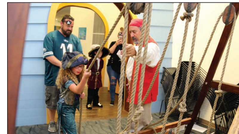
Captain Kidd's Pirate Day: 420 visitors explored the life of a pirate on ship and shore in July.