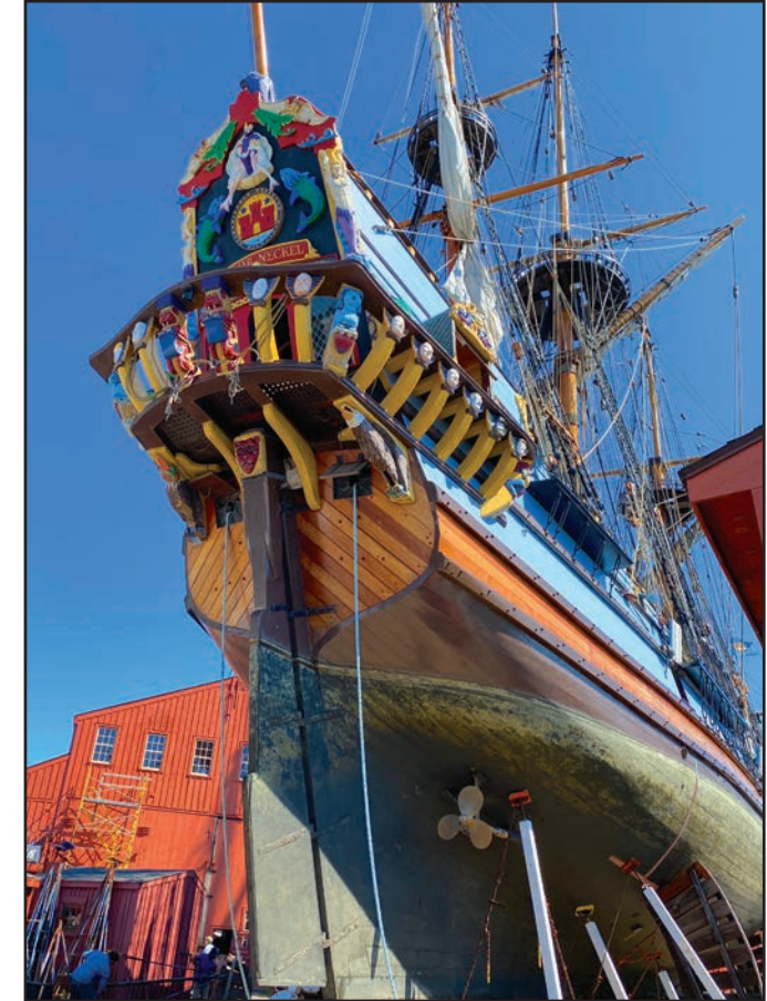
2022 Dry Dock at Mystic Seaport Museum: Loyal volunteers and ship staff labored for our biennial U.S. Coast Guard hull inspection.