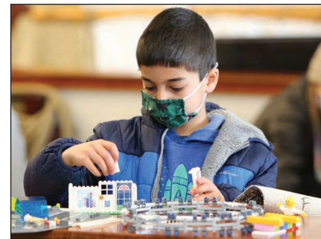
LEGO Shipbuilding Day 2022: 350 enthusiastic STEM model builders and creative fans returned in March.