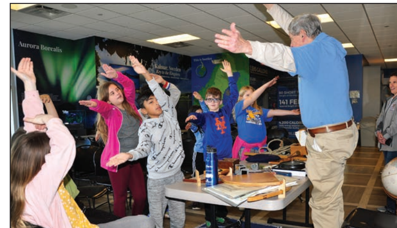
Our donor-funded Flagship Field Trip Fund provided free field trips to all K-12 Delaware students during the 2021-22 school year.