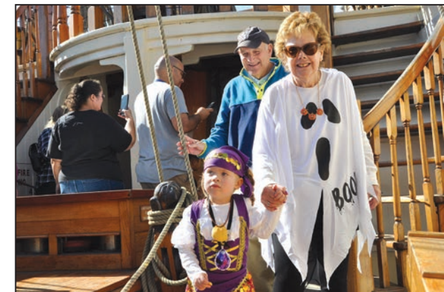
Halloween Ghost Ship: our 4th annual spooky family fun day attracted 885 visitors for ship tours and more.

9,500 Visitors to KNF and community programs.