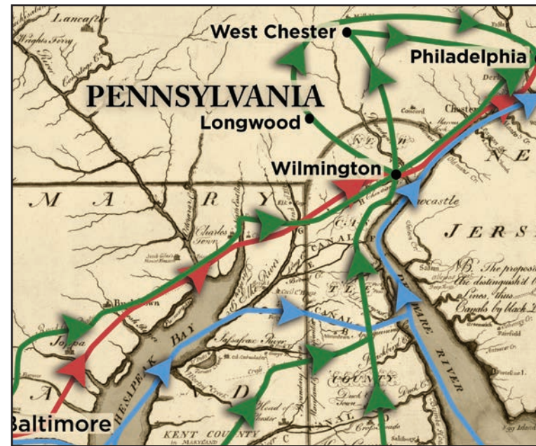
Five Ways to Freedom was designed and introduced by our education team as an interactive lesson on Delaware's maritime Underground Railroad.