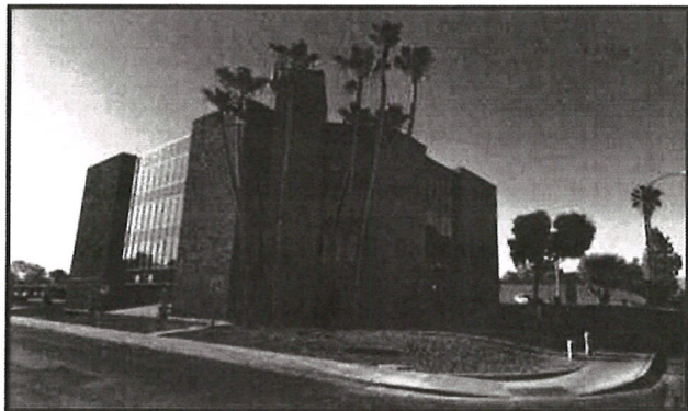
Central Valley 3221 N. 16 th Street, Ste 100, Phoenix, AZ 85016 1 block south of Osborn on Flower Street