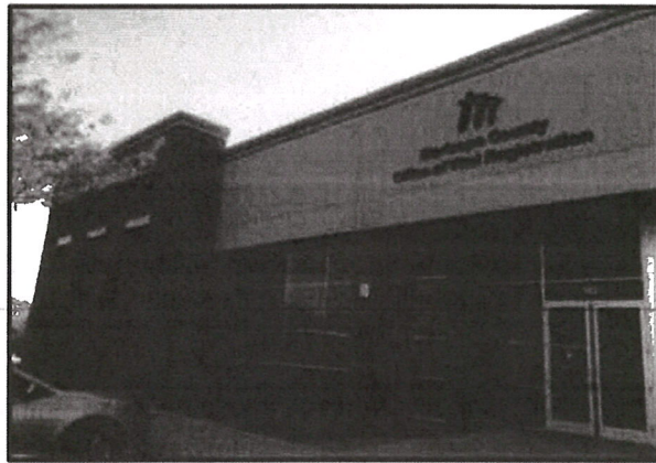
West Valley – In West 101 Business Center 1850 N. 95th Avenue, Ste 182, Phoenix AZ 85037 North of McDowell Road