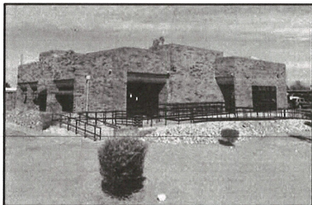
East Valley – Maricopa SE Complex 331 E. Coury Avenue, Mesa, AZ 85210 South of US 60 and west on Mesa Drive